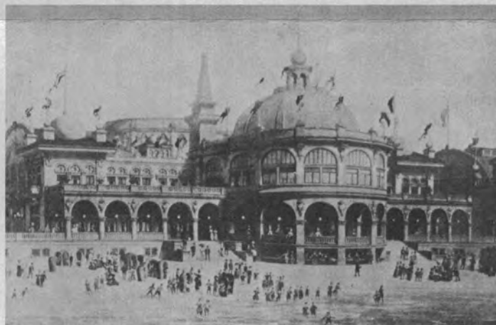
Bathing Pavilion and Auditorium, Santa Cruz