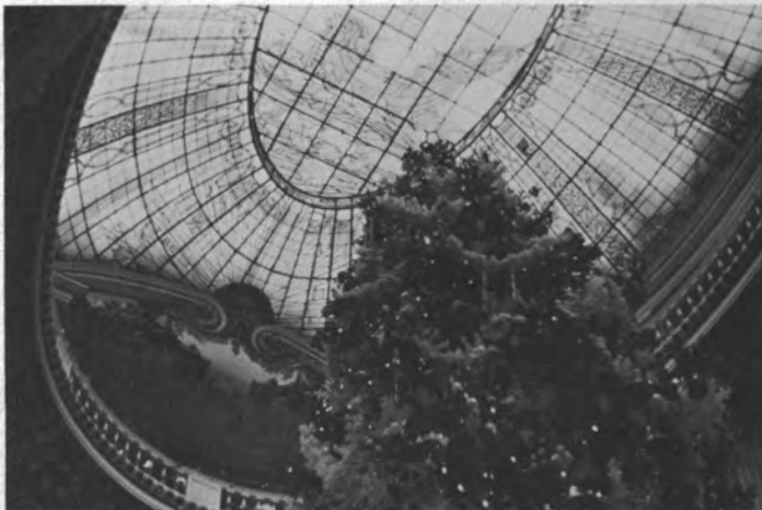
The City of Paris building rotunda with the last Christmas tree, December, 1973.

Through several lengthy public hearings, Neiman-Marcus representatives maintained that the building was not earthquake-proof, despite photographs which show its facade intact following the 1906 temblor. They also stated that the store would not be appropriate for their "high quality" merchandise, although one proponent said it could become the "architectural jewel in the collection" of art connoisseur Stanley Marcus.