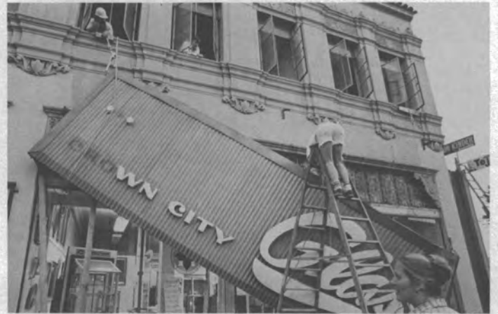
Removing unsightly signs in Pasadena

cade improvements on a five to one matching basis while the City is providing a three to one match for seismic improvements using the alternate building codes in effect in San Diego.