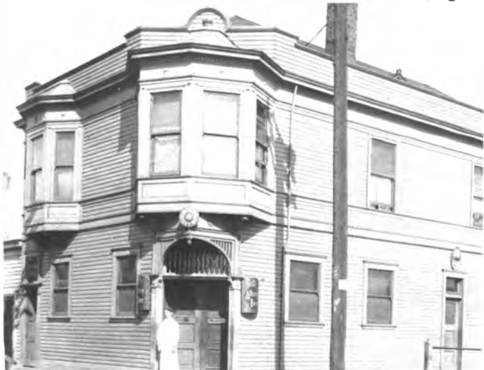
Jurgensen's Old Corner Saloon (The Lido), ca. 1900.

In 1984, encouraged by the election of pro-preservation Mayor Marilyn O'Rourke, (see page 7)