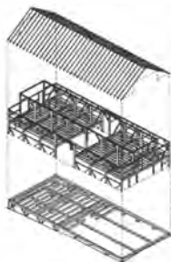
THE USE OF COMPUTERS IN HISTORIC PRESERVATION