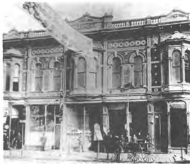
Old Oakland's Leimert Building, as it was and as it is again, thanks to Storek & Storek, Architects.