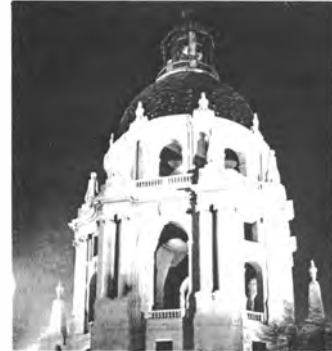
The restoration of Pasadena's City Hall was a big 1990 Design Award winner at the San Francisco Conference in April.

This eighth round of CPF Preservation Design Awards may have exhibited the greatest diversity of projects honored so far. The Ninth Annual Preservation Design Awards will be presented at our 1991 Santa Barbara conference in May. Entry forms for this next year's competition will be available in January.