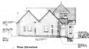
Working drawings for the Phoenix Lake Log House restoration in Marin prepared by Architects Page & Turnbull.

(1) Notable for the involvement of volunteers working under the direction of an architect was the restoration of the Falkirk Greenhouse in San Rafael. The local non-profit preservation organization was instrumental in saving the Falkirk Estate and assembled a team of volunteers to accomplish the tasks of restoring the greenhouse. Working with members of the architectural team, they formed several subcommittees: donations, fundraising, and volunteer coordination. The structure is one of the few Victorian greenhouses remaining in the Bay Area.