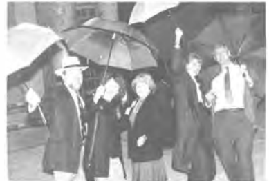
"Historic Walking Tours in the Rain," Palo Alto Stanford (PAST) Heritage's presentation at "Three Minute Success Stories" held in San Francisco's Palace (under construction) Hotel.