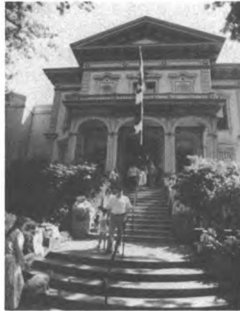
Crocker Art Museum

many of the secrets of the house have been opened up for discovery. These will not be open for long since funding for the restoration has been raised by the Stanford Mansion Foundation and the restoration may commence by this summer.