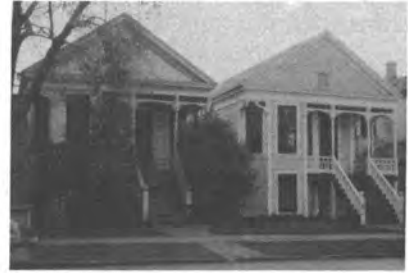
Typical Sacramento old city street-scape

Our opening reception will be held in the wonderful Heilbron Mansion. This 1881 mansion is now a cultural center for La Raza Bookstore and La Posada Gallery.