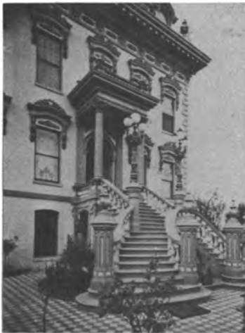
The Leland Stanford Mansion (photo credit: GHI Architects)

Considering Sacramento is the State Capital, it's easy to lose sight of the fact that Sacramento is a city with multiple personalities. Sacramento is the political center of California, but Sacramento has also become the hub of a growing region. Sacramento is still the historic home of the Gold Rush era, and significant remnants of that past have been preserved and restored. Sacramento still has its country town ambience just blocks away from the Capitol and downtown — in neighborhoods of turn-of-the-century homes and stately elm trees. Sacramento is still the River City and the American River Parkway makes this urban area more attractive than ever. And, Sacramento has changed since the last preservation conference, with attractions both new and old for the visitor.