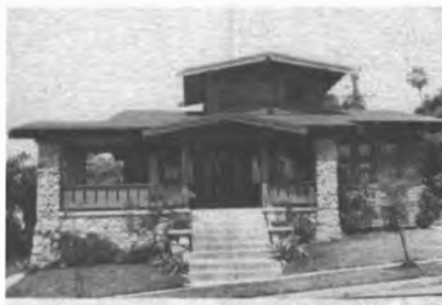
This year's favorite calendar — with nifty Arroyo-edge buildings and bungalows like this — comes from The Eagle Rock Association ... available from T.E.R.A. ( P.O. Box 41453 Eagle Rock, CA 90041-2912) for $12 (which includes shipping & handling).