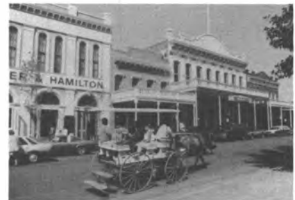
Old Sacramento on the River's edge

On the Sacramento Riverfront the Delta King Riverboat has been restored as a bed and breakfast. Arrangements have been made with the Delta King, as with all of the bed and breakfast lodgings, for special conference rates. The Hartley House, Amber House, Stirling Hotel, and Driver Mansion will provide the most exquisite rooms for visiting preservationists.