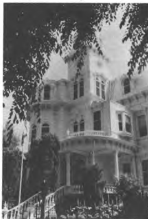
Governor's Mansion

The Crocker Annex, the remnants of E.B. Crocker's 1860s home, was turned into a modern art gallery. The exterior of this structure was returned to its 1880s appearance. One room of the gallery was developed as an interpretive museum allowing display of some of the original Crocker furnishings.