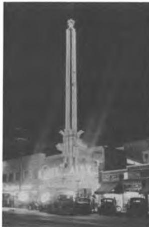
Glendale's Alex Theatre will celebrate its grand Reopening on New Year's Eve. Saved as a result of citizen action and ultimate purchase by the Redevelopment Agency, this is one of the great success stories. For tickets to this Gala call (818) 552-5263.

equipment will be renewed inside the station house for display purposes only. The arch will sit against the Hill Street sidewalk and the queuing areas at the top and the bottom will contain disabled access provisions as well as interpretive displays of the railway's history and artifacts. It is envisioned that the railway will link the new Metrorail station and restored Grand Central Market at Hill Street with the commercial areas at the top of Bunker Hill.