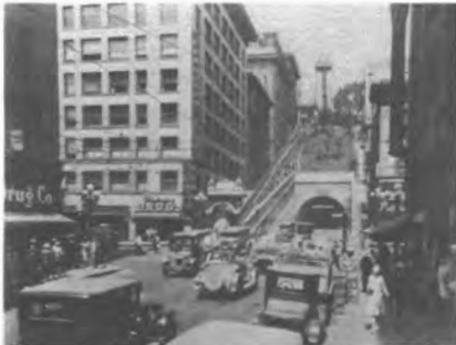
Angels Flight, as it was before being dismantled to allow for the redevelopment of Bunker Hill

The restoration and rehabilitation of Angels Flight Railway in downtown Los Angeles is underway at several venues. Originally built in 1901, the funicular transportation system was reported to be the world's shortest railway. The new track length will be about three hundred feet long and will travel up a 19 degree incline constructed of reinforced concrete to match the original trestle. The original wooden cars have been preserved and the chassis are being retrofitted with steel to accommodate the new cable, axles and braking systems while not disrupting the historic wooden fabric. Disabled access provisions will be provided in one car and exiting and safety requirements will be integrated to conform to Public Utility Commission and Los Angeles Building Code standards.