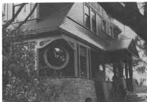
Extraordinary earthquake recovery

This 1887 Queen Anne landmark was left twisted and racked when its seven-foot tall sandstone foundation crumbled in the Loma Prieta earthquake. Faced with severe damage and no funds for repair, the owners assembled funding from the National Trust, California Family Grants, the American Red Cross, the Town of Los Gatos, and CAL DAP-O, and began restoration one and a half years later. This is a skillful restoration accomplished in the face of great odds.