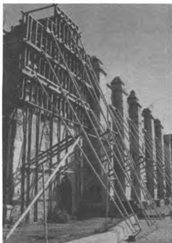
San Gabriel Mission supplied the first families to settle Los Angeles

Constructed around 1800 on the site of a mission founded in 1775, the San Gabriel Mission Church is the oldest structure in the area. In addition to its religious function it is an important element in the Spanish settlement of California and has played a major role in Los Angeles regional history. After it was damaged in the 1987 Whittier Narrows earthquake, a repair and seismic strengthening scheme was developed using an innovative engineering model based on design of thick wall structures such as nuclear reactors. The scheme was carried out without major intrusion into the church's historic space.