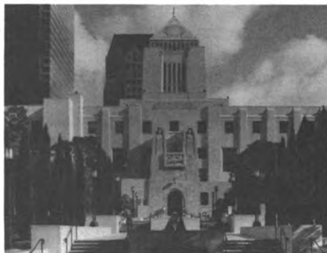
Bertram Goodhue's Central Library — back in service in downtown L.A.

Designed by Bertram Goodhue in 1926, Los Angeles' historic Central Library was saved from demolition after a long effort by the preservation community, and a lengthy renewal process delayed by a major fire. Using a combination of preservation approaches, the library was successfully converted to contemporary use while restoring the crowning pyramid, the Rotunda interior, and other key historic elements. A highlight was creation of the Maguire Gardens, re-establishing the historic West Lawn over a subterranean parking structure for more than 900 cars.