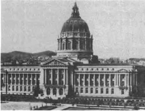
San Francisco City Hall moves another step toward a sensitive seismic retrofit

San Francisco's Beaux Arts City Hall, a National Historic Landmark, was severely damaged in the Loma Prieta Earthquake. The survey of the existing conditions, including analysis of up to ten elements in each of over 1000 rooms, was a massive task. The compilation of information using a database was part of an innovative approach to a challenging project.