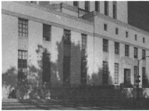
Ramps subtly merge into the architecture entering the Alameda County Courthouse

ramps and lifts at the ceremonial entrance on Fallon Street. The final solution integrated a ramp with the original granite base without major alteration to the appearance of the historic structure, and provided dignified access through a primary entrance to the disabled community.