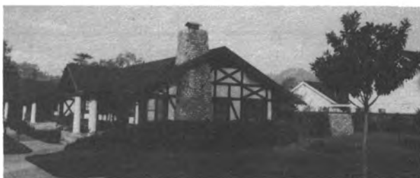
Gartz COURT (circa 1910)