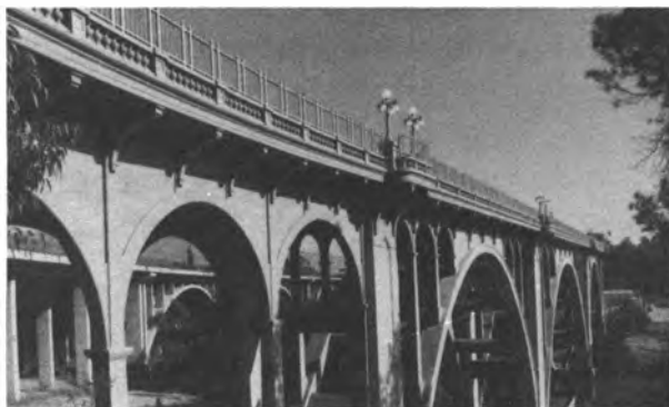
Pasadena's Arroyo Bridge — A Winner