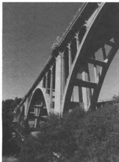
Spanning the Arroyo, again !