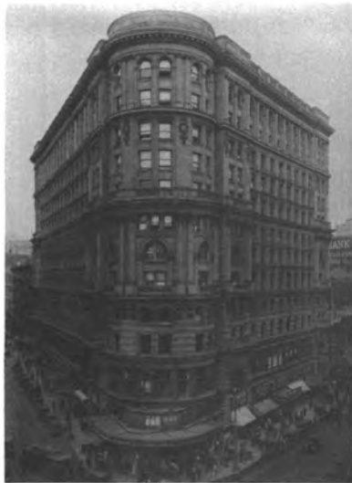
Historic photo of the Flood Building on Market Street

De Leuw Cather & Company City of Pasadena