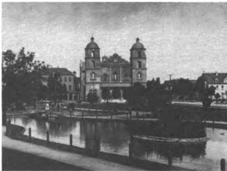
The dedicated efforts of a parish save a church in Sacramento

Carey & Co., Inc., Architects John F. Otto, Inc., Contractor St. Francis of Assisi Catholic Church