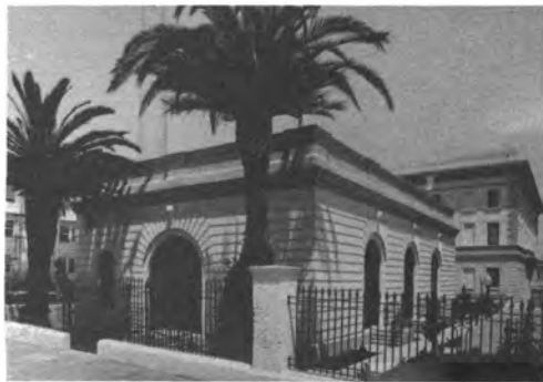
Mercy Family Plaza — a great adaptive use on Golden Gate Park's Panhandle

Sandy & Babcock Inc., Architects The IbeX Group Mercy Charities Housing California