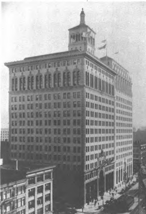
PG&E Headquarters in San Francisco (ca. 1920s).