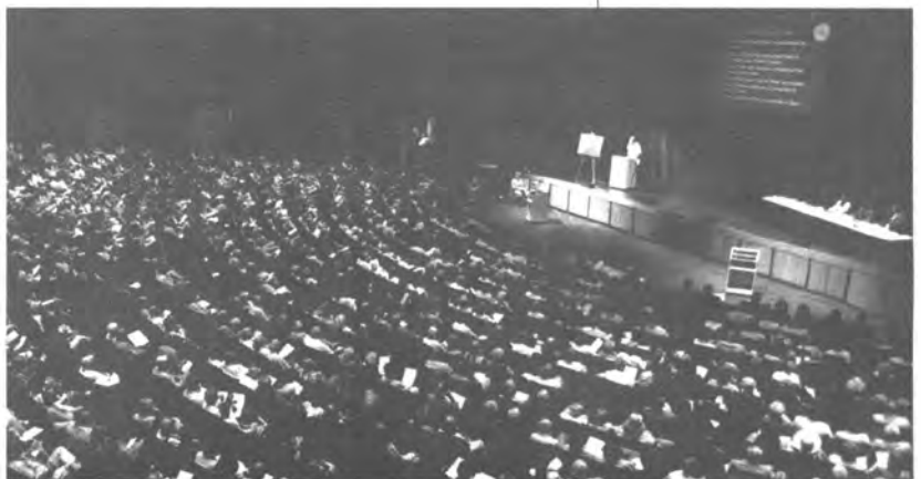
More than 1500 people packed the Terrace Theater in downtown Long Beach to protest plans to demolish historic buildings at the Long Beach Naval Station.

The next phase of the Section 106 consultation involves a smaller number of participants in a series of intense discussions. The preservation interests are represented by Long Beach Heritage, which also filed a lawsuit challenging the Port's Environmental Impact Report for failure to contain an adequate alternatives analysis. As we go to press, these discussions are ongoing.