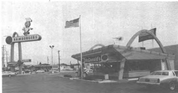
The Downey McDonalds.

Reversing an earlier controversial decision, McDonald's Corp. has announced that the oldest surviving McDonald's in the nation will be restored and re-opened with a menu and uniforms resplendent of its 1953 origins. A museum and gift shop will be built next door. McDonald's announcement was a great victory for Downey city officials and area preservationists. They have argued strongly for restoration of the building since it was closed three years ago. McDonald's had cited earthquake damage and lack of indoor seating and a drive-up window as reasons for the closing. The National