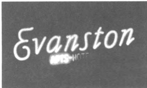
Wilshire Boulevard neon

Neon became the rage during the 1920s and Wilshire earned the nickname of "the Neon Corridor." But during World War II, most of the signs were