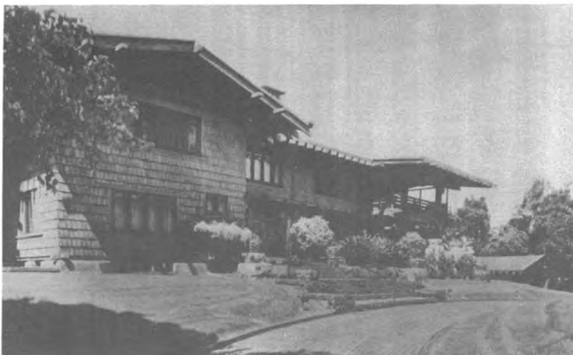
The Gamble House, ca. 1908 (Photo courtesy of the Gamble House).

Registration materials will be mailed in January. However, please call CPF Program Associate Paige Swartley at 510/763-0972 to ensure your name is on the mailing list.