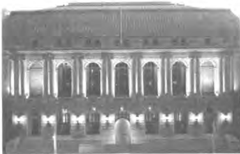
Veterans War Memorial Opera House, San Francisco, CA

PRESERVING THE DIGNITY OF HISTORIC BUILDINGS WITH INNOVATIVE STRUCTURAL ENGINEERING