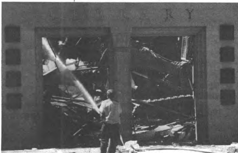
The Sacramento City College Library was built in 1936-37 and funded in part from the Works Progress Administration. It was listed on the National Register of Historic Places.

CPF strongly supports the Register program, but will ask at the public hearings for removal of the added sections. The first public hearing is September 27 in Sacramento. It is important that CPF members review the Proposed Regulations, submit comments to OHP c/o the California Register Coordinator by September 15, and attend the hearings. To obtain a copy of the Proposed Regulations or the Rulemaking Calendar for the California Register, contact the Office of Historic Preservation at 916/653-6624.