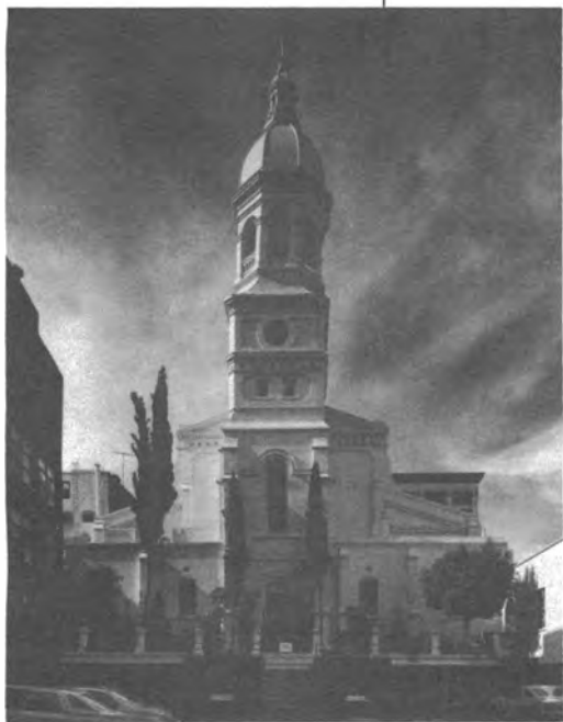
St. Vibiana's Cathedral before removal of the bell tower.

Special thanks go to the Preservation Action Council of San Jose; the California Office of Historic Preservation; the Western Regional Office of the National Trust for Historic Preservation; the Santa Clara County Historical Heritage Commission; the 1996 Conference Steering Committee; and the Conference Leaders, Partners and Friends listed on page 12.