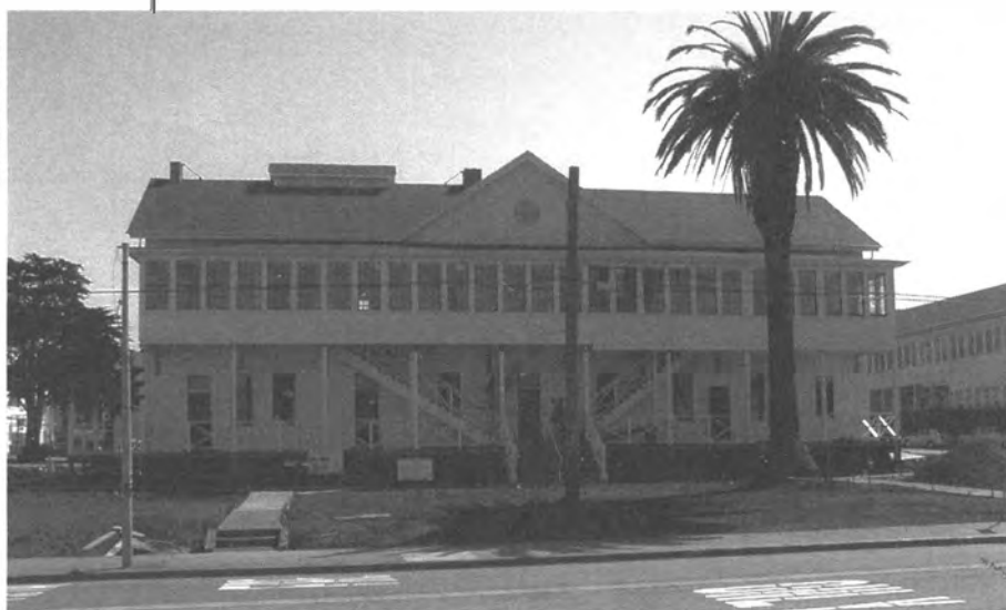
Building 36: Constructed in 1885 during the Presidio's Civil War expansion era, the two-story wood frame structure was one of a pair of artillery barracks. It is also one of the few remaining buildings from the period when the Army built rows of one and two story Italianate barracks along the Main Parade Ground.

the Presidio Trust is near completion. Building 36, the former Military Police Headquarters, is being rehabilitated to make it safe and functional as a multi-tenant building. Constructed in 1885 during the Presidio's Civil War expansion era, the two-story wood frame structure was one of a pair of artillery barracks. It is also one of the few remaining buildings from the period when the Army built rows of one and two story Italianate barracks along the Main Parade Ground.