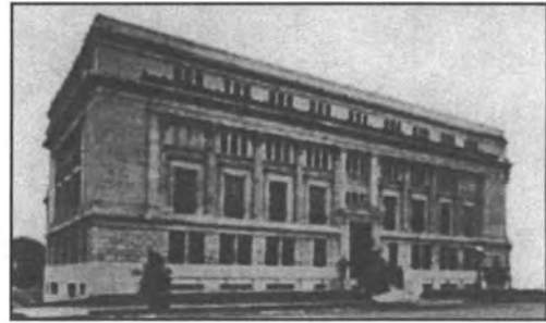
Sacramento Hall of Justice c.1920

P.S. Preservation Services recently completed Part I and II documentation for this tax certification project.