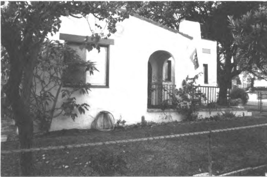
North facade of second bungalow rehabilitated by the Heritage Home Ownership Program

Heritage Housing's homeowner grant program was created to complement its rehab