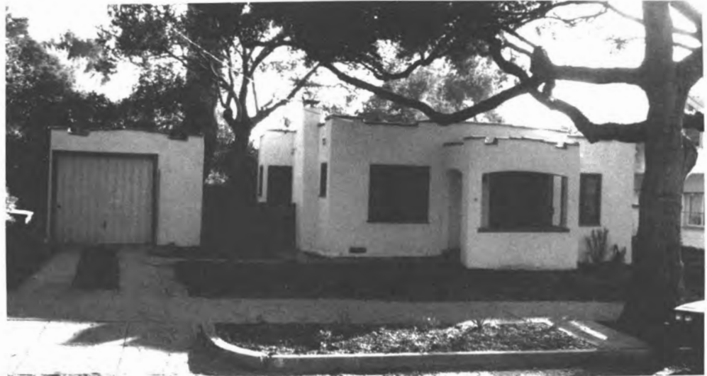
One of two bungalows rehabilitated and sold to low to moderate income first-time home buyers by Pasadena Heritage's Heritage Home Ownership Program. This home is located in Garfield Heights in Pasadena.