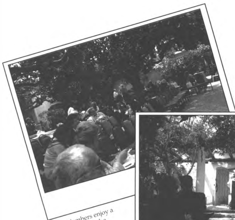
CPF Members enjoy a picnic lunch in the Memory Garden at CPF's Annual Membership Meeting.