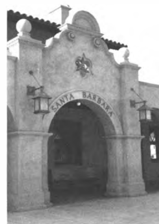
Santa Barbara Depot

To everyone involved in helping to shape and create a very impressive forum for California preservation and for California preservationists... CONGRATULATIONS!