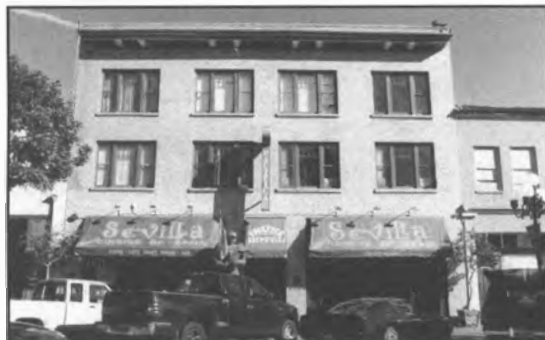
Pacifica Hotel, San Diego

included the rehabilitation and/or adaptive reuse of residential units, a pier bulkhead and adjoining shed, a bakery, office buildings, movie studio offices, military installation structures, and numerous hotels throughout the state. Project floor areas ranged from 2,600 SF to just over 193,000 SF for average project size of 66,184 SF. Project