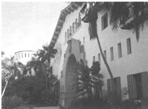
Santa Barbara County Courthouse