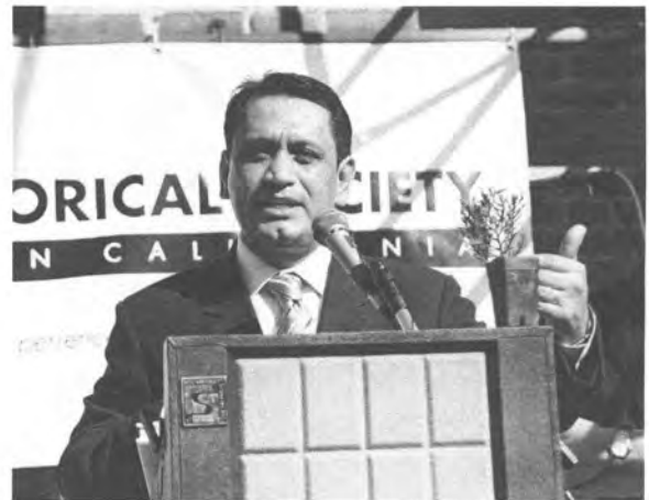
Gil Cedillo Milton Marks Legislator of the Year