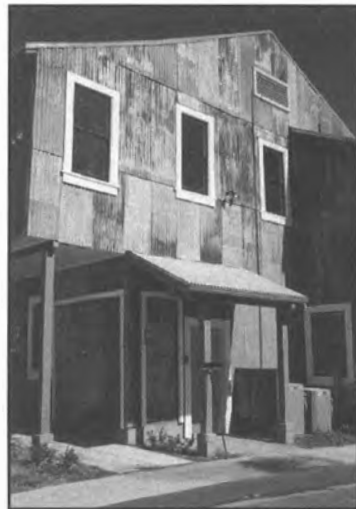
Ike's Cafe / Stage Depot, Walnut Grove

The National Park Service (NPS) in 2002 designated thirteen California projects as "certified rehabilitations." These completed projects were determined to meet the Secretary of the Interior's Standards for Rehabilitation and be consistent with the historic character of the property or district in which they were located. Building types