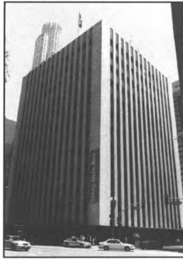
Superior Oil Company Building, Los Angeles

Applicants are encouraged to take advantage of an expedited fee payment system by including with their application an authorization for the NPS to charge the certification processing fee to their credit card. The authorization form is available on-line from the NPS web site. By not using the