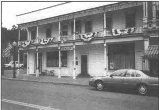
Ivanhoe Hotel, Ferndale

SHPOs are the point of contact for property owners wishing to use the rehabilitation tax credit. The SHPO office can guide property owners to individually listed properties and to existing historic districts and contributing buildings that are already eligible. In addition the SHPO office may be able to provide technical guidance before a project begins to make the process as fast, appropriate, and economical as possible.