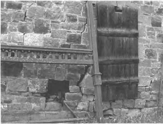
Crumbling wall of the John Marsh House in East Contra Costa County

More of the Old John Marsh Stone House in East Contra Costa County is on the verge of collapse. The house, built in 1854 by California pioneer John Marsh, is owned by California State Parks which currently has no funding available for its restoration.