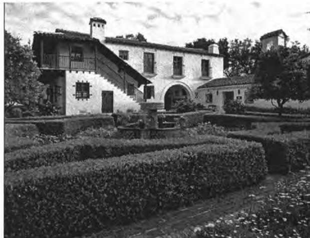
Allied Arts Guild