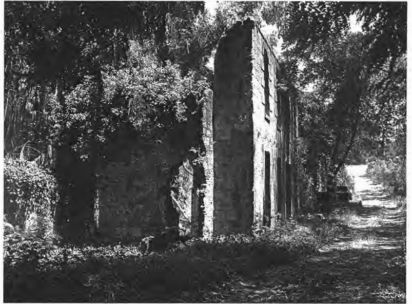
Ruins at Napa Soda Springs—see page 5

State Historic Building Code Workshop Northern California