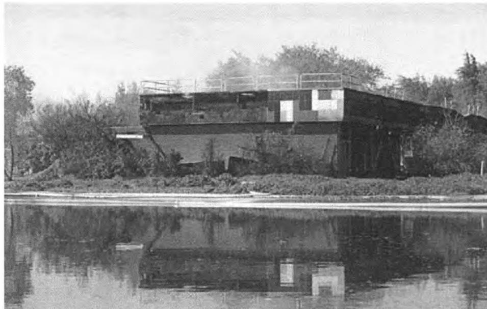
Fire severely damaged the historic IBM Building 25 on March 8, 2008.

Unfortunately, Modern resources are being lost daily. The day I wrote this Note, a devastating fire took a disastrous toll on IBM Building 25 (1957) in San Jose, a John Bolles-designed Modern building that preservationists have been struggling to save for years. IBM invented the flying head disk drive in Building 25, which was eligible for listing in the National Register and California Register, and as a local historic resource. In 2004, the Preservation Action Council of San Jose sued Lowe's and the City of San Jose, successfully arguing that the City violated CEQA by approving the demolition of Building 25 and the construction