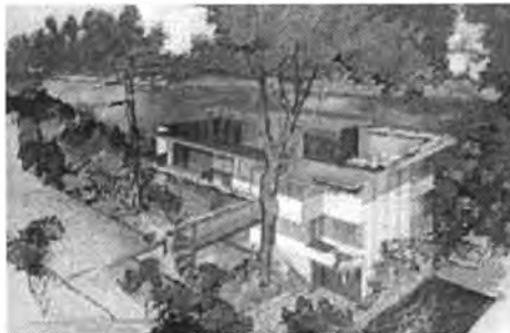
Rear of the VDL House