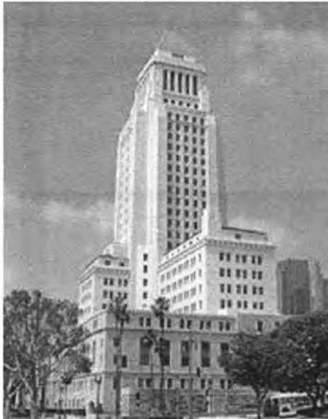
Los Angeles' historic City Hall (home of Los Angeles' City government and the Office of Historic Research)

Pilot surveys are beginning in April 2008 and will test the effectiveness of the historic context statement, field guide, data management strategies and public participation