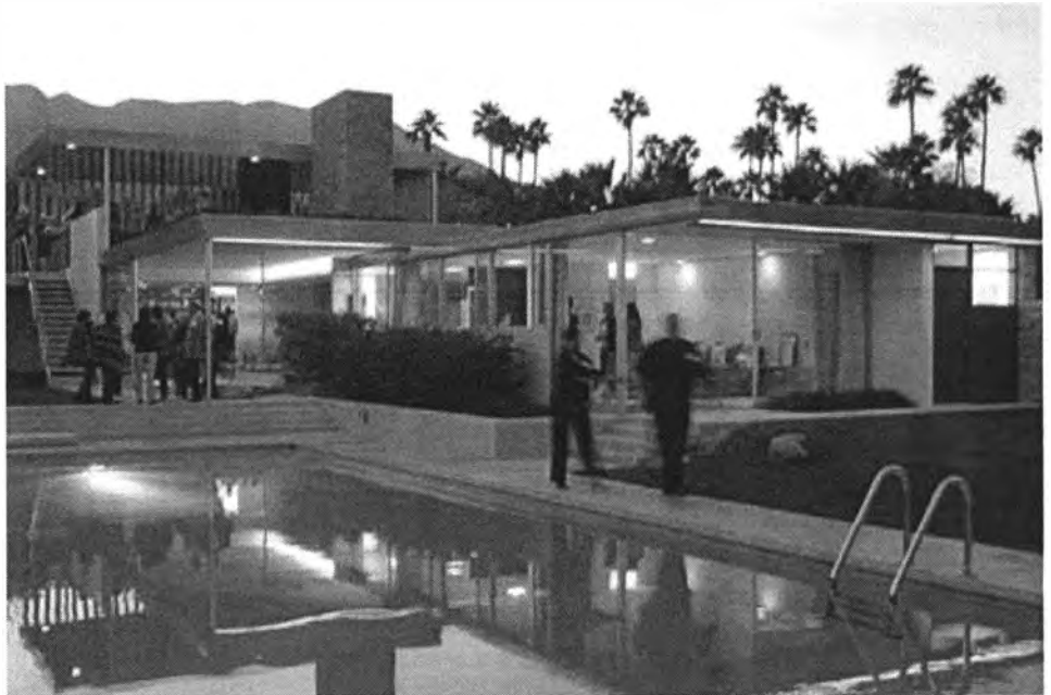
Kaufmann House, poolside.