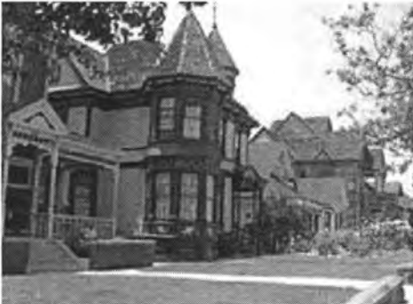
A streetscape in the Angelino Heights Historic Preservation Overlay Zone, one of Los Angeles' original suburbs from the 1880s and 1890s.

The consultant team is also developing a Field Guide to Survey Evaluation. The Field Guide is both a written training manual, which outlines field methodologies and best practices, and a computerized GIS survey database that will "translate" the context statement into data fields. This mobile application will allow survey teams to identify and evaluate resources in the field using tablet PCs.