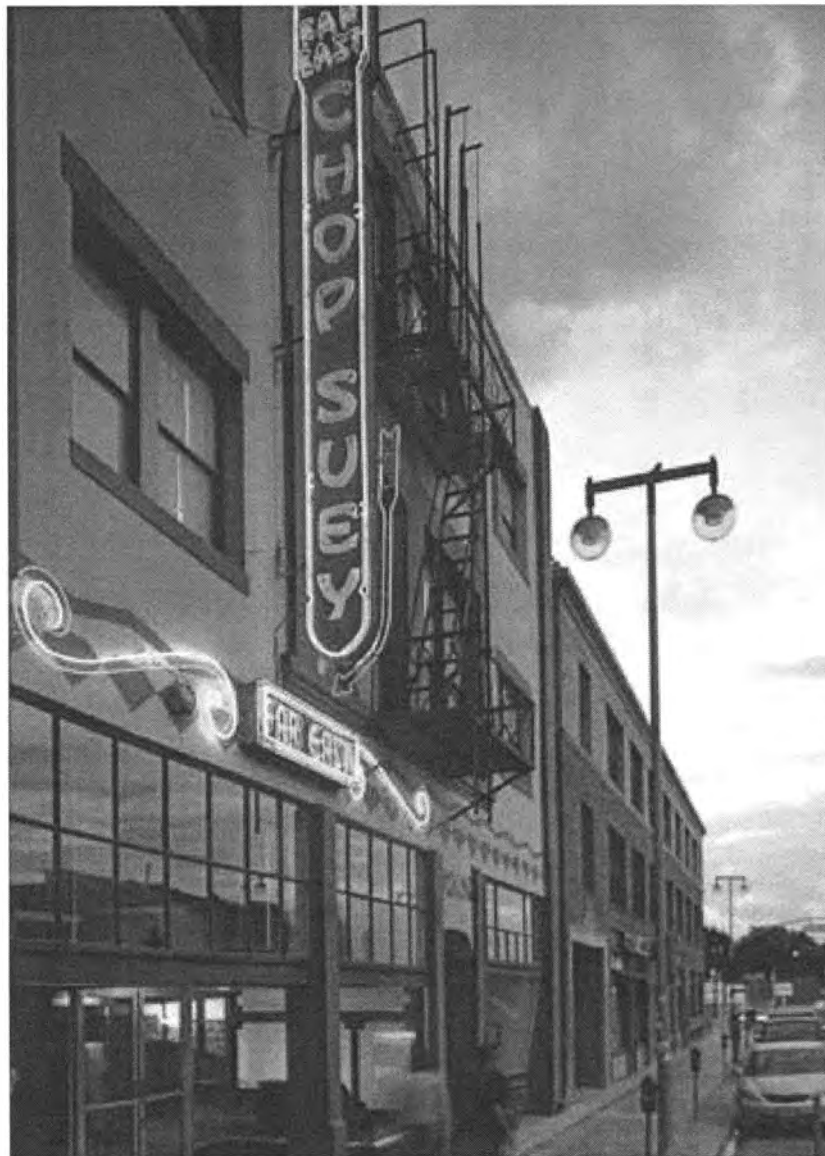
The Far East Cafe in Little Tokyo—a long time hangout for generations of Japanese Americans—is an example of the type of social and cultural resources to be identified through SurveyLA.