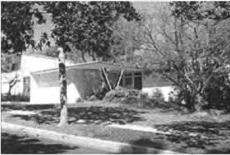
A home in the Gregory Ain Mar Vista Tract, the City of Los Angeles' first post-World War II historic district. SurveyLA will focus heavily on Los Angeles' postwar heritage, as much of Los Angeles was built after 1945.