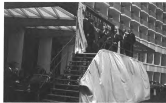
Historic photo of the Century Plaza Dedication.

Land Management for the maintenance, rehabilitation and restoration of “facilities, properties, trails and lands and for abandoned mines and wells,” and $180 million for construction and energy-efficient retrofits of existing facilities.”