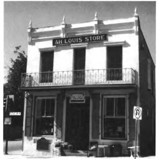
Above, Ah Louis Store, San Luis Obispo

The survey is scheduled to be posted on April 20, 2009. Survey results will be posted on the Architectural Review Unit page of the Office of Historic Preservation web site. If you would like to receive notification of the survey launch, please send an email to areyes@parks.ca.gov .