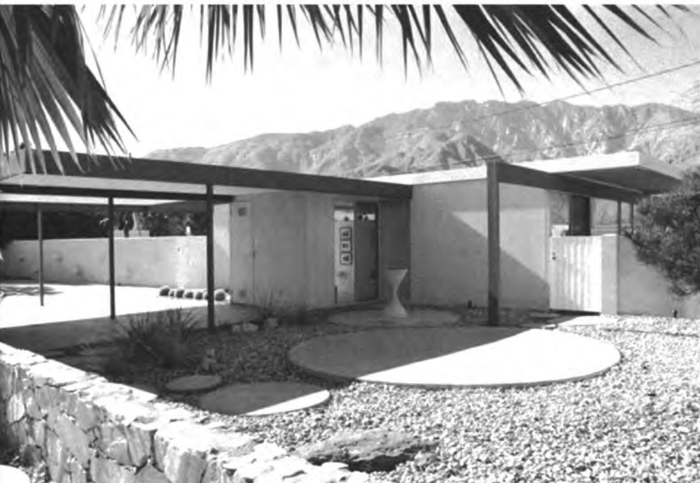
The Don Wexler Steel House, part of the Mid Century Modern Tour "Modern Housing for a Post War Nation"