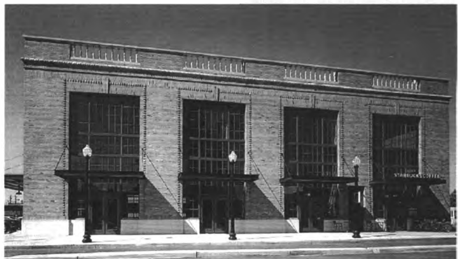
Below, REA Building, Sacramento