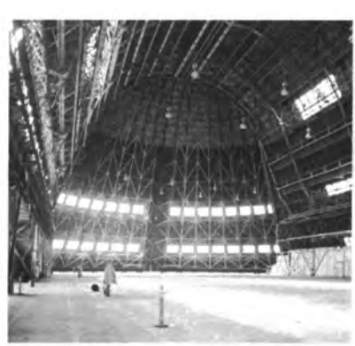
Far left, Century Plaza.