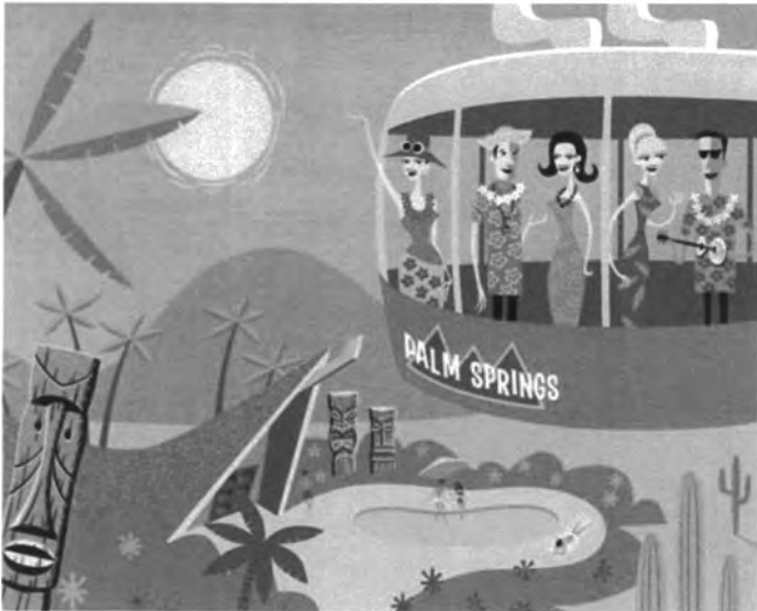
Above, Fun print by the artist SHAG of the PS Aerial Tramway, one of the attractions of Palm Springs. © SHAG. Courtesy MModern Gallery