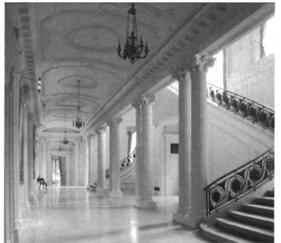
Top, 2007 PDA Winner, Piers 1½, 3 and 5, in San Francisco.