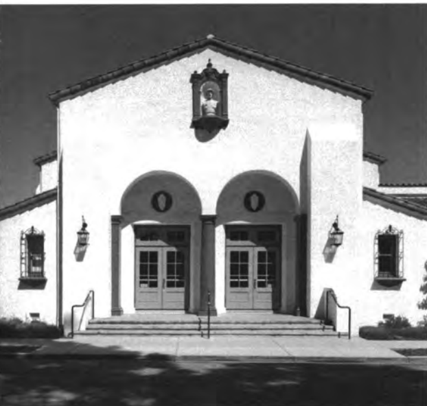
Left, 2008 PDA Winner, Washington Township Veterans Memorial Building, in Fremont.