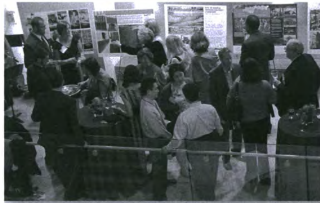
2012 Awards Reception.

On Saturday, October 1, 2011, the beautiful San Francisco Conservatory of Music was the site of the 28th annual Preservation Design Awards. The awards recognize people and projects throughout the state of California dedicated to preservation and restoration, while upholding important aspects and values of sustainability, use, and design in their work.