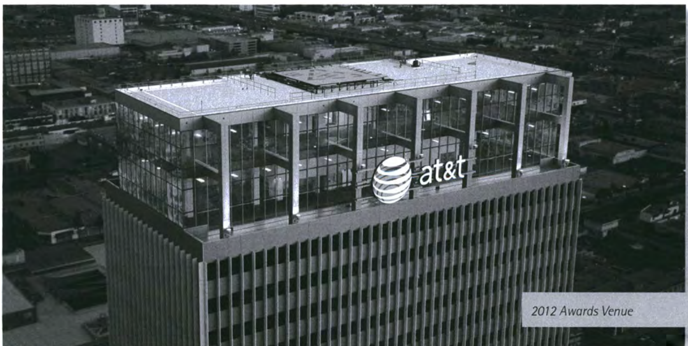
2012 Awards Venue

nomination for the President's Awards. The deadline for submitting a nomination for the President's Awards is Monday, July 9th. Nominations are accepted in three categories: President's Awards, Preservationist of the Year and the Milton Marks Award for elected officials. The CPF Board of Trustees will select winners of the President's Awards at their July Board meeting in Pasadena. All CPF members are encouraged to submit nominations for the President's Awards. Applications can be downloaded from www.californiapreservation.org/awards . For more information, please call our office at 415.495.0349.