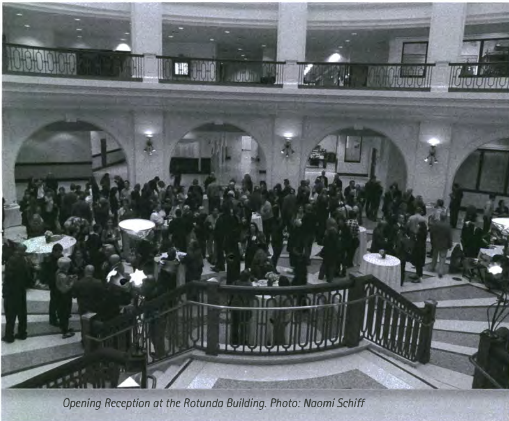
Opening Reception at the Rotunda Building.