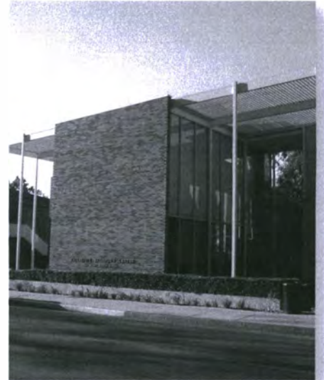
University Religious Center