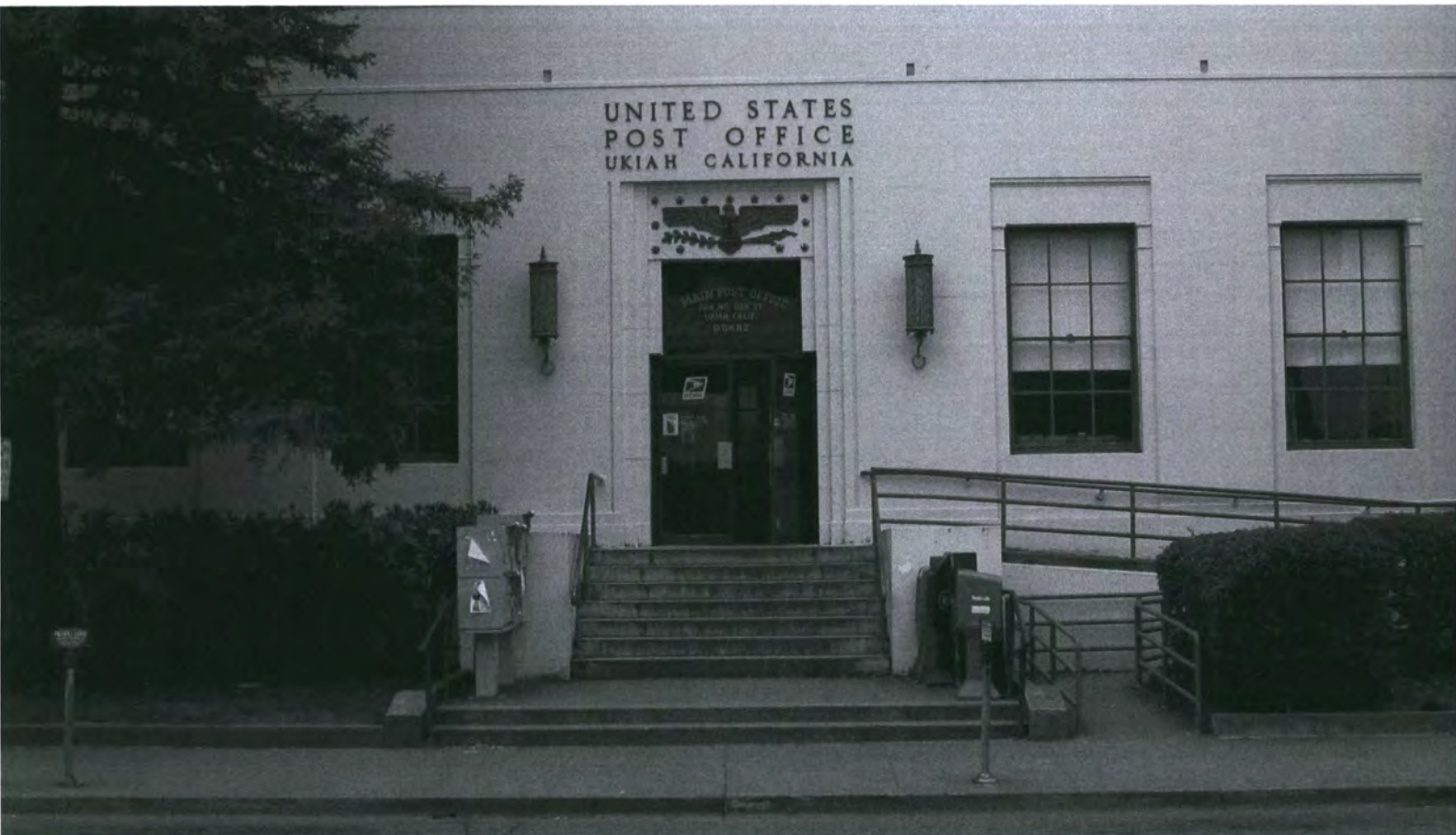
Above: Ukiah Post Office. Photo: Gray Brechin Living New Deal Project. Below: Ukiah Post Office Interior Mural Photo: Gray Brechin Living New Deal Project

several months, with full relocation complete in late 2012. The stated reason for this relocation is that the building is too large and has unneeded space. The building itself was designed by a prominent local architect, Birge Clark, whose buildings can be found throughout the city and still retains its historic interior.