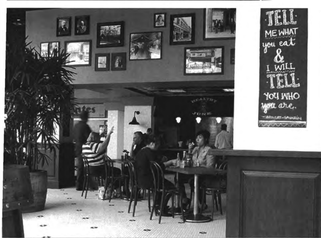
Downtown Anaheim.