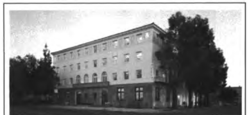
28 th Street YMCA, Los Angeles.