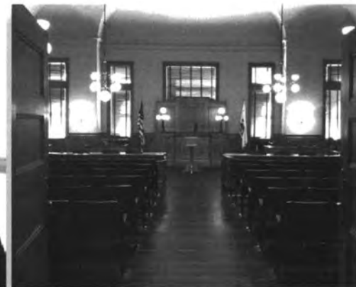
Keynote speaker Shaheen Sadeghi; Old Orange County Courthouse.

Based at the historic Crowne Plaza Anaheim Resort, the conference will include special events and tours that highlight Orange County's rich architecture, landscapes, and history, including the Old Orange County Courthouse—Los Rios Historic District—Casa Romantica—Anaheim Citrus Packing House—Crystal Cove State Park—Helena Modjeska Historic House and Gardens—Old Towne Orange—Crystal Cathedral—Muckenthaler Cultural Center—Chapman University—among others.