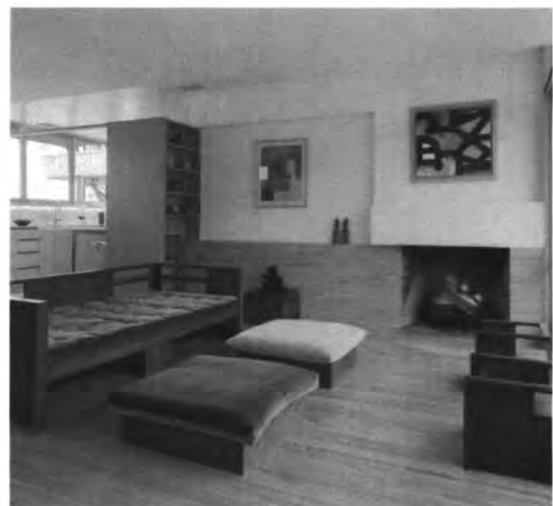
The Schindler house, Los Angeles.