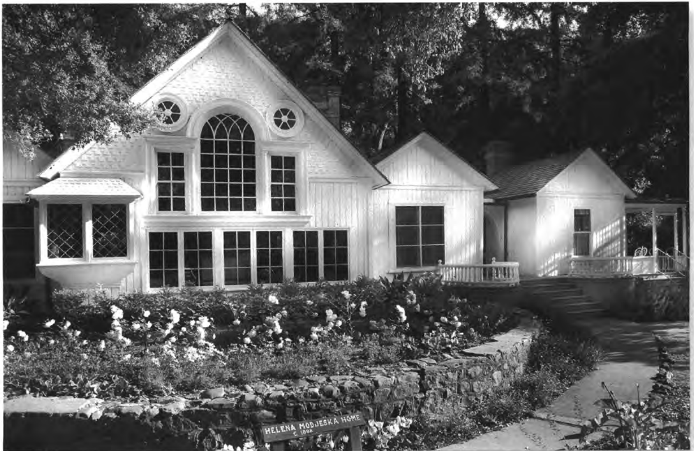
Arden Modjeska house.

OC Parks also realizes the importance of history and historic preservation, with seven historical sites within the park system ranging from the Helena Modjeska Historic Home & Gardens—designed by New York architect Stanford White and once the home of Shakespearean actress, Modjeska, from 1888-1906—to the original courthouse in Orange County, the Old Orange County Courthouse, active from 1901-