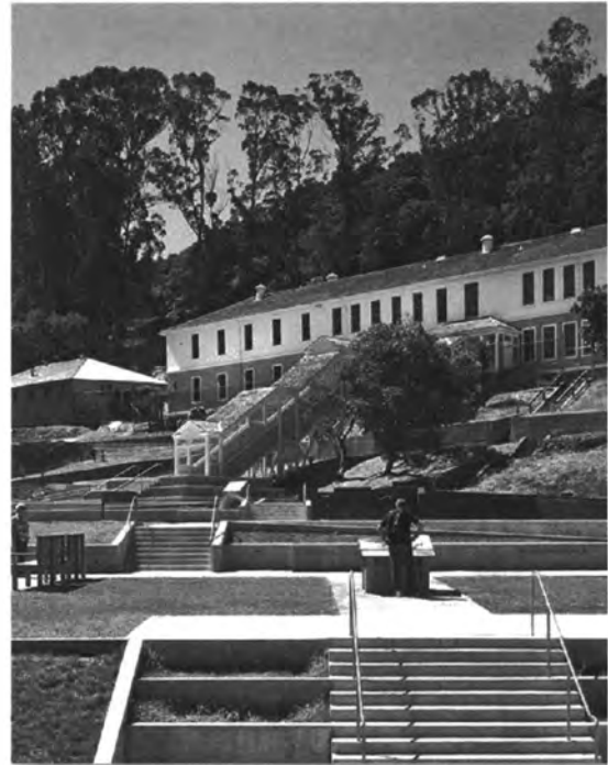
Angel Island.

To enter a project, visit www.californiapreservation.org/awards.html .