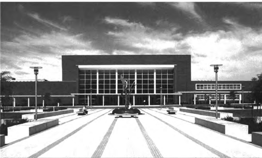
Richmond Memorial Civic Center.