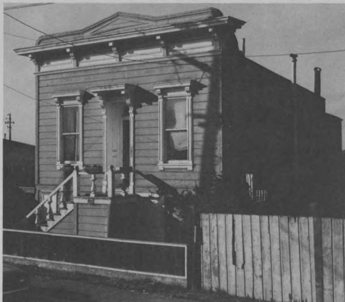
Typical working class Victorian in Ocean View.

The coming of the West Berkeley Station in 1876 and incorporation with the college town of Berkeley in 1878 drew many workers who settled in West Berkeley. From the house-building boom that took place from 1878 to 1893, we have just a few cherished Victorian remnants. The struggle to prevent the wasting of West Berkeley came to a head recently with two incidents. A