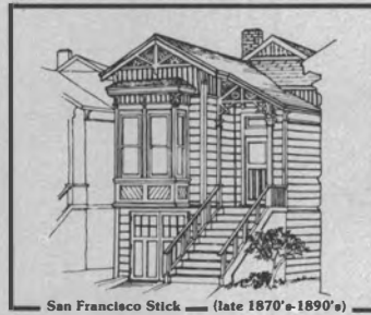
San Francisco Stick (late 1870's-1890's)