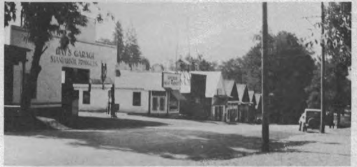
Weaverville in the Twenties; the Old Fire House (with tower and square false front) center.

The county-wide survey, encompassing an area of more than 3,000 square miles, has been successful thus far because of the willingness and enthusiasm of Trinity County citizens, especially the old timers who share their knowledge of County history and participate in recording it. Methods used in a rural survey, of course, differ from those employed in an urban setting. The County has been divided into twelve geographical areas and the survey uses long-time residents of each area to coordinate the identification and documentation of resources. Sites are seen by foot, horse, or whatever means necessary. Forms used in other surveys are often not applicable because of the nature and large number of non-structural sites, such as thousands of mines. The question of "significance" has also been rethought to broaden the concept to encompass such multiple