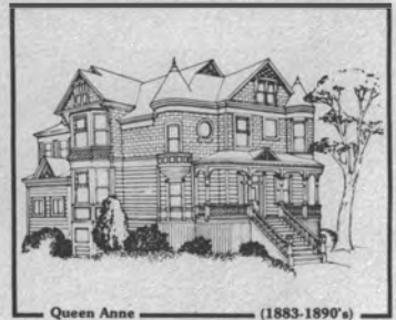
Queen Anne (1883-1890's)