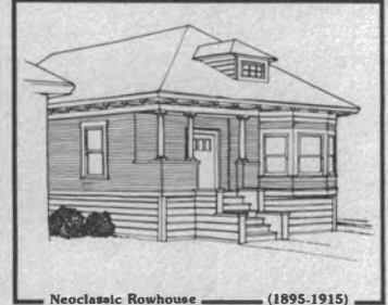
Neoclassic Rowhouse (1895-1915)

REHAB RIGHT produced by the City of Oakland Planning Department, provides the missing link in currently available home repair literature. Conventional home improvement books which offer detailed instructions are typically insensitive to architectural design and difficult to apply to older building styles. Restoration manuals, on the other hand, show architectural awareness, but their technical explanations are usually cursory. With the introduction of REHAB RIGHT, a thoroughly instructive and design sensitive manual is at last available to guide rehabilitation of pre-1945 houses.