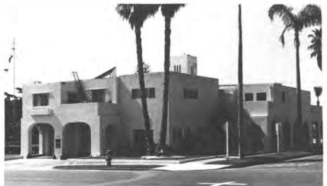
Irving Gill Firehouse, Oceanside (1929)

The Oceanside City Council voted to preserve the historic city hall and fire station buildings and incorporate them into the site plan for the new civic center, despite the estimated $100,000 additional cost. Both structures were constructed by noted architect Irving Gill in 1929.