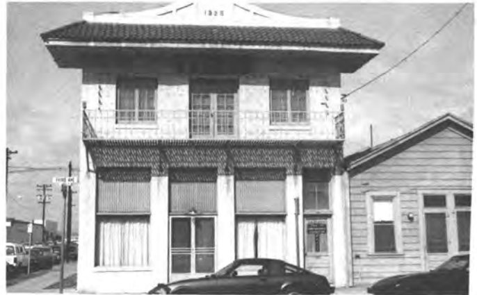
The Labor Merchants Association Building in San Diego's Chinese thematic district.

Downtown San Diego is also home to the last remnants of a once-thriving Chinese community. Only nine buildings of architectural and historical significance to the Chinese community remain of an estimated thousand. The nine structures were built about the turn of the century.