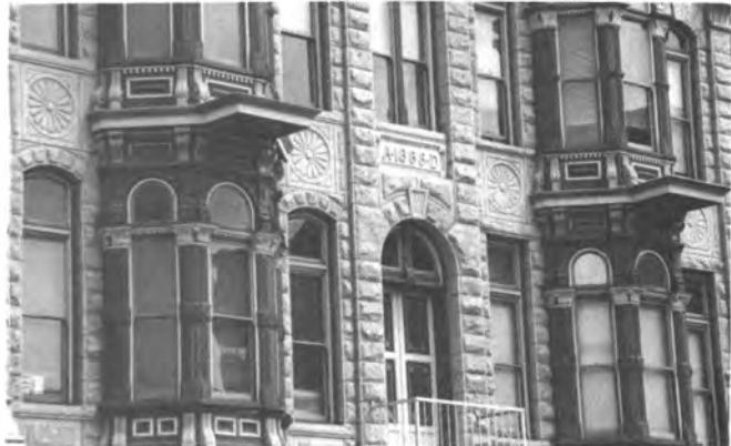
What's the bid on this fine Gaslamp facade??

There is still time to enter the "Three-Minute-Success Stories", Foundation "DESIGN AWARDS" competition, golf tournament and reservation space for the Saturday evening banquet and auction in the Hotel del Coronado's Crown Room is still available...but you must act quickly.