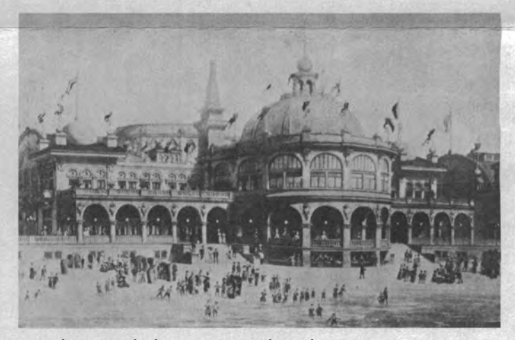
Bathing Pavilion and Auditorium, Santa Cruz