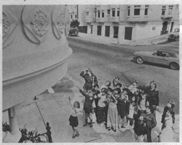
Students learn to identify architectural details.

Immediate results have been fruitful, and students have produced may drawings, photographs, reports, and research. But besides a lingering appreciation of Victorian homes, the volunteer program also encourages students to enter the restoration crafts. Thus they can help future San Franciscans preserve and maintain the city's irreplaceable legacy of 19th century architecture.