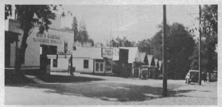
Weaverville in the Twenties; the Old Fire House (with tower and square false front) center.

The county-wide survey, encompassing an area of more than 3,000 square miles, has been successful thus far because of the willingness and enthusiasm of Trinity County citizens, especially the old timers who share their knowledge of County history and participate in recording it. Methods used in a rural survey, of course, differ from those employed in an urban setting. The County has been divided into twelve geographical areas and the survey uses long-time residents of each area to coordinate the identification and documentation of resources. Sites are seen by foot, horse, or whatever means necessary. Forms used in other surveys are often not applicable because of the nature and large number of non-structural sites, such as thousands of mines. The question of "significance" has also been rethought to broaden the concept to encompass such multiple