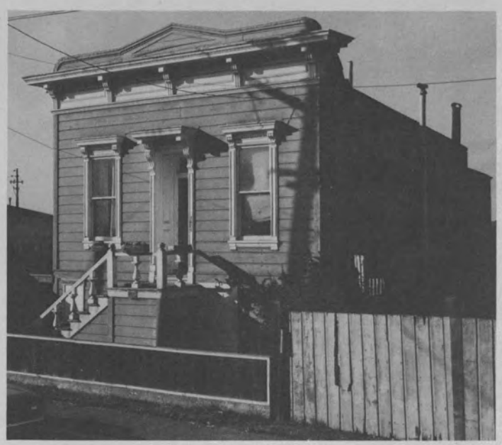
Typical working class Victorian in Ocean View.

The coming of the West Berkeley Station in 1876 and incorporation with the college town of Berkeley in 1878 drew many workers who settled in West Berkeley. From the house-building boom that took place from 1878 to 1893, we have just a few cherished Victorian remnants. The struggle to prevent the wasting of West Berkeley came to a head recently with two incidents. A