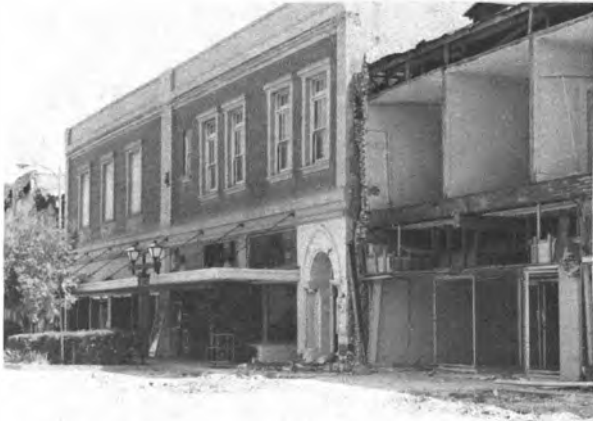
Downtown Coalinga soon after the quake

On May 2, 1983, a 6.1 - 6.5 Richter Magnitude earthquake struck the city of Coalinga, California, damaging all of the early twentieth-century buildings of the downtown area. By mid-July the entire downtown had been razed.