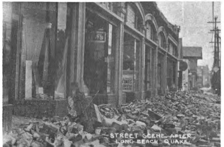
50 years ago Long Beach fared no better. The 1933 Long Beach quake led to the "Field Act" which has led to the demolition of many public buildings.

In summation, disaster planning is an important part of the preservation process. Only official designation of structures and districts will ensure consideration for historic resources by federal and state agencies. Preparedness on the part of building owners is essential: they should strengthen their buildings if they can, and should be able to secure them quickly to prevent hazards to the public. Finally, they should know engineers who can help them if their building is damaged in a disaster. They must plan for all these items before an emergency happens; afterwards -- as Coalinga proved -- is just too late.