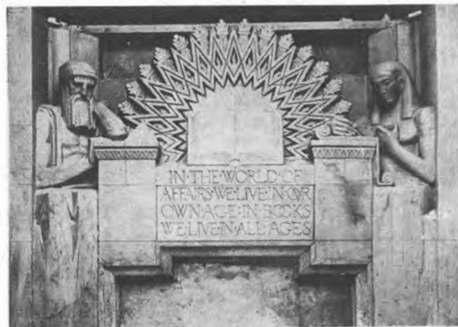
Sculptural relief from Bertram Goodhue's L.A. Public Library, another building that is to benefit from "Development Rights Transfer"

Registration fees are $84 ($75 for APT members).