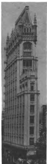
THE CATHEDRAL BUILDING -- OUR NEW OAKLAND ADDRESS

NON-PROFIT ORGANIZATION U.S. POSTAGE PAID BERKELEY, CALIF. PERMIT NO. 308