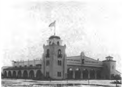
Hangar No. 1 at LAX now serves an adaptive use as cargo and office facilities (Avla Development Group/Gin Wong Associates)