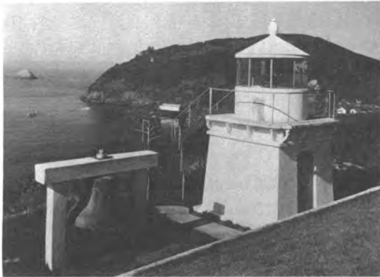
Part of the lure of Humboldt County is its rare combination of history and scenic beauty, typified by the Humboldt Light at Trinidad Bay

This exciting series of informative and entertaining educational tracks provide a strong incentive to attend the 1992 California Preservation Conference. Don't miss out — plan to be in Eureka on April 23-26, 1992.