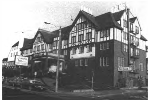
The Eureka Inn will serve as 1992 Conference headquarters

1615 Broadway, Suite 705 Oakland, California 94612