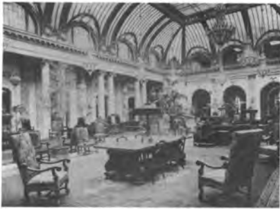
Restoration of the Garden Court at the Palace Hotel in San Francisco (Skidmore, Owings & Merrill/ Page & Turnbull)