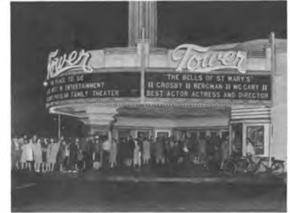
Fresno's Tower Theatre — circa 1939 when it first opened — again will serve as an active centerpiece for the now historic neighborhood