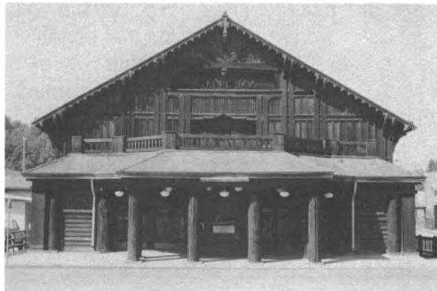
The Winema Theatre in the company town of Scotia, site of "Three-Minute-Success Stories"

Victorian Architecture. Boasting more Victorian structures per capita than any other city in the state, Eureka provides the perfect setting to study Victorian architecture. This track not only examines the wide range of Victorian styles, but also provides sessions on preservation and restoration of existing buildings. Tours are planned to see Eureka's intact Victorian neighborhoods and a lumber mill that continues to produce moldings and other Victorian finishings.