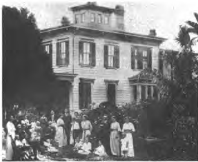
The Sexton House in the Goleta Valley, circa 1910