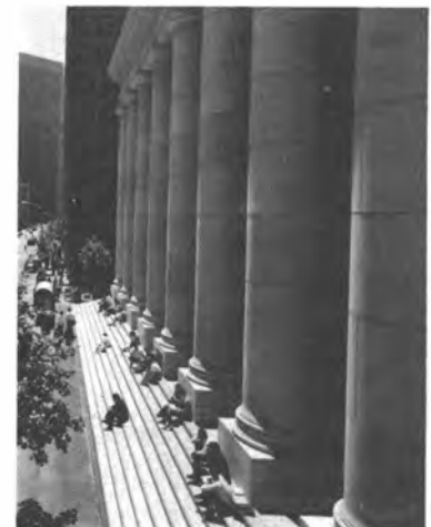
San Francisco's 1924 Federal Reserve Bank