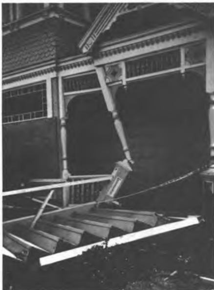
The "Gumdrop House" shifted off of its foundation, the quake's lateral movement putting undue stress on the porch supports which buckled. This condition can be repaired despite the appearance which suggests total ruin.

The coincidence of the earthquake occurring near a gathering of preservation/seismic experts, preservation professionals had the opportunity to participate in the initial inspections and damage assessments, and deal with preservation issues immediately.