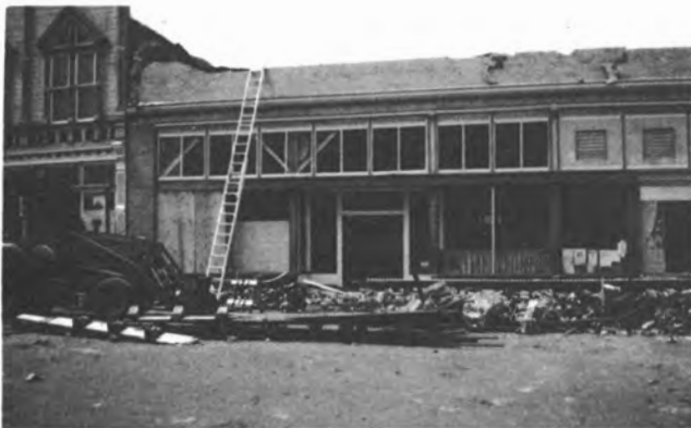
This quake's most-often-photographed building (Fern-dale' Smith Grocery) was ultimately demolished despite efforts to convince owners that it was an "easy fix."

CPF, as most of you well know, held its annual conference in Eureka from April 24 to 26. The conference was planned to be different from the start. First, it was the first time the conference was held in the upper part of Northern California. Secondly, a folklife track was added to explore the relationship of preservation to cultural resources, and how cultural resources relate to physical resources. The third event to make this conference a memorable one was the Cape Mendocino earthquake. What was remarkable about this particular earthquake was the fact that some of the state's more prominent experts in the seismic retrofit of historic buildings were gathered some thirty odd miles from the epicenter of the quake.