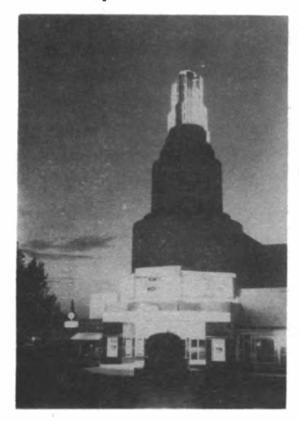
Sacramento's Tower Theatre

Sacramento is the focus of the conference this year, but what surrounds Sacramento is as interesting as the capital city. Conference tours will explore some of this wonderful heritage and offer conference attendees the chance to see that part of