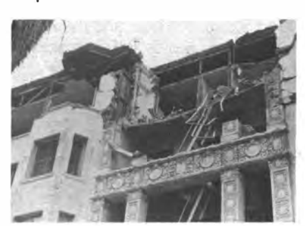
Affordable housing (in historic buildings) could be the big loser in Santa Monica

Beyond these statistics is the impact on the community's neighborhoods. Homes and those markers of place that make the neighborhoods special were in jeopardy. Damage to the historic Charmont, El Cortez, Sovereign and Embassy apartment buildings displaced hundreds of residents.