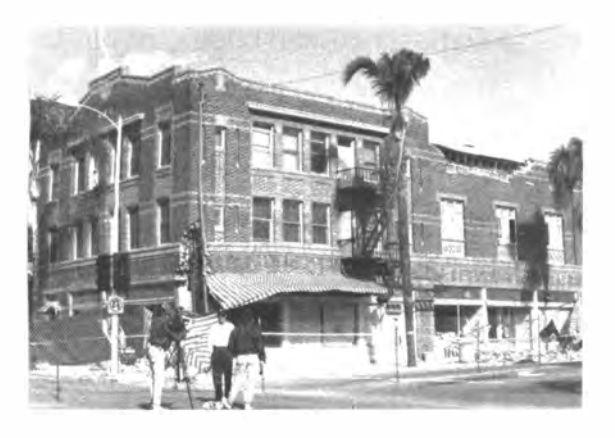
Fillmore's Masonic Temple — red-tagged but repairable — was demolished on February 8 despite a restraining order filed by local citizens attempting to buy some time for a thorough structural study.

6.8 at the epicenter, death, destruction and twenty-two billion dollars in losses, the Northridge quake will long be remembered. As reports slowly came in we learned that far too many historic buildings were damaged, especially in Hollywood, Santa Monica and Fillmore. But evidence of this earthquake's power and wide impact could be found nearly everywhere — hundreds of structures in South Central L.A. still uninhabitable, the Coliseum red-tagged, Santa Monica's beautiful First Christian Church demolished, the Leonis Adobe in Calabasas sagging from corner failure and much of Fillmore's main street in shambles.