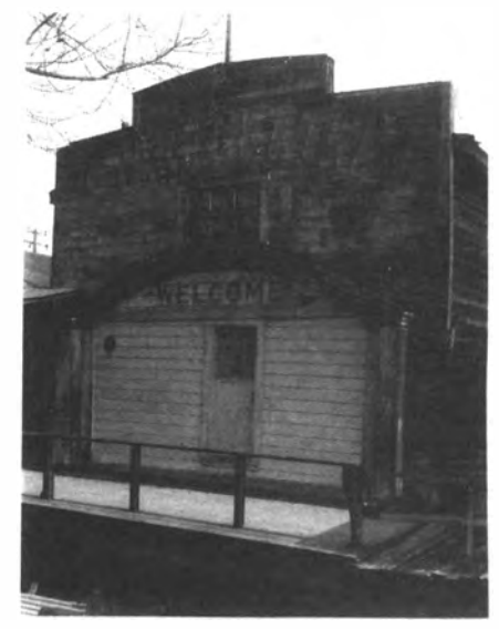
The Star Theatre in Locke