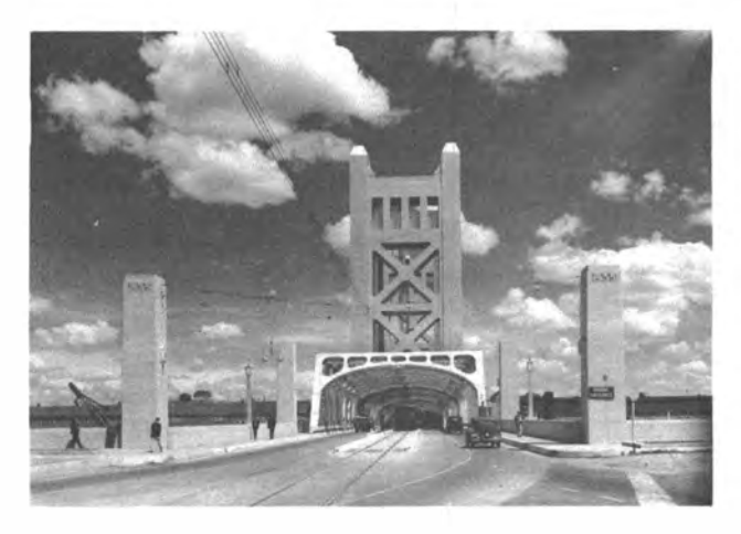
A golden bridge is Sacramento's western gateway

Other sessions address affordable housing and historic buildings, the base closures' effect on historic military resources, the "property rights" challenge, preserving churches, public archaeology, preservation basics, the architecture and cultural resources of the 1950s and beyond ... and much more.