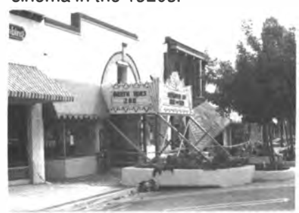
In Fillmore, ten days after the quake, it looked like it had just happened

City officials were very much in control, having fenced off the entire downtown and tagged every building in the city. Crews were underway cleaning up debris and officials were expediting permits to rebuild. Only four historic buildings were proposed for demolition and the decision to demolish the buildings was being left to the owners. Included on the list was the magnificent Masonic Temple. the architectural "anchor" to downtown, and the Fillmore Theater, a classic live-stage turned cinema in the 1920s.