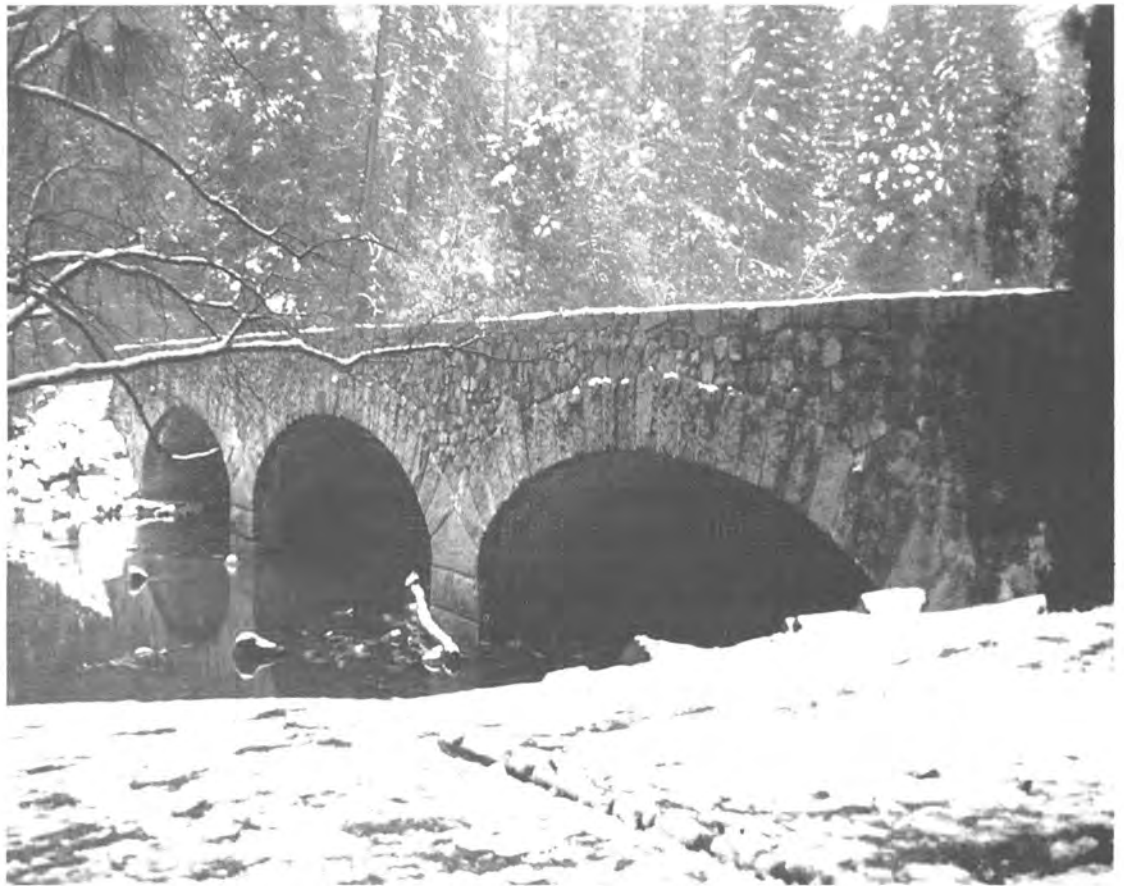
Historic bridge in Yosemite Valley.

By Anthony Veerkamp Perhaps no place illustrates the complexities of reconciling natural and cultural resource protection better than Yosemite Valley, one of the nation's most treasured landscapes.