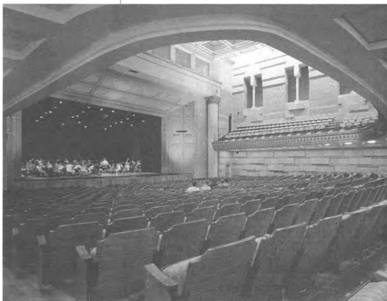
The interior of Royce Hall on the UCLA campus.

premier recording and performance concert halls in the world, and possibly the finest in the western United States. It had become the recording hall of choice for Andre Previn, former conductor of the Los Angeles Philharmonic.