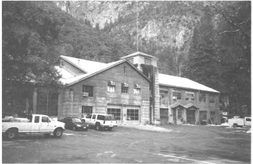
Art Deco fire station slated for removal.

decisions to be made. Take the bridges. A highly significant element of the historic landscape in Yosemite Valley is the National Register-listed Rustic Style bridges which span the Merced River. Some of the most important views immortalized by painters and photographers are the result of the careful placement of these bridges in the landscape. Environmentalists, however, are concerned that these bridges have