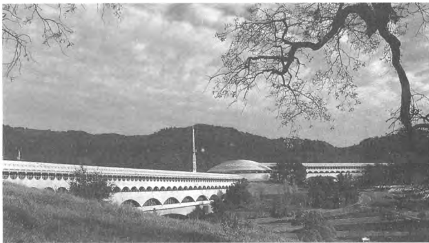
The Marin County Civic Center.