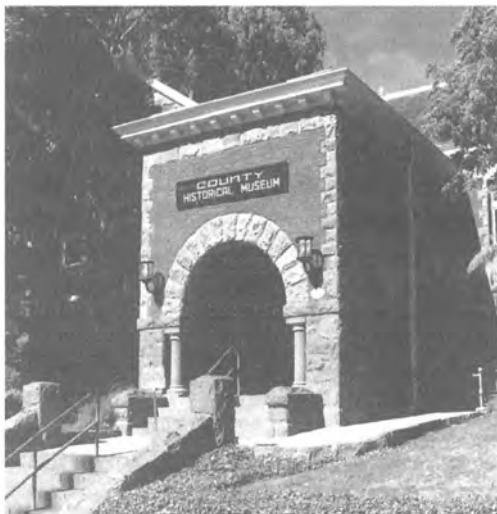
San Luis Obispo County Historical Museum.

Kundert Medical Building, many fine Victorian homes and the Sauer-Adams Adobe, an 1860-era house, are among San Luis Obispo's architectural treasures. Stop by the County Historical Museum to learn about the town's past, including its pre-Hispanic, Spanish and American periods. The museum is housed in the