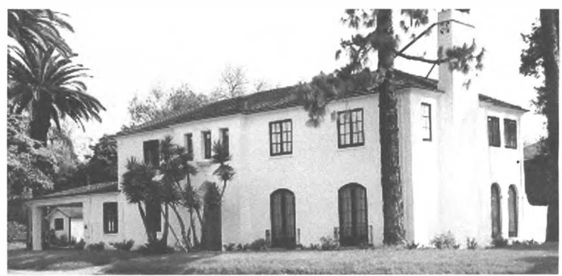
One of the threatened homes in the 710 extension right-of-way.

CPF received encouraging news in June when a favorable ruling was issued in the 710 freeway litigation. U.S. District Court Judge Dean Pregerson tentatively granted an injunction barring Caltrans from spending any funds on construction of the controversial project, which would directly impact more than 1000 homes and six National Register Historic Districts in its route through South Pasadena, El Sereno and Pasadena.