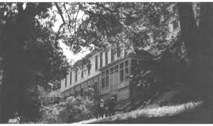
These barracks, used between 1910 and 1940 primarily by male immigrants, also house the immigrants' surviving poetry.

Unless stabilization and rehabilitation are undertaken soon, many of California's stateowned historic places, including the Angel Island Immigration Station, with its poignant record of hope and heartbreak, will cost more to repair or, at worst, become too costly to repair at all.