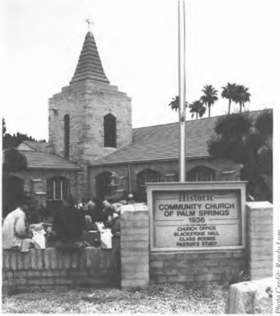
4 California Preservation Foundation Newsletter, July 1999

The 1999 Conference was sponsored by the California Preservation Foundation. The City of Palm Springs and the State Office of Historic Preservation served as co-sponsors. Participating organizations included: The American Institute of Architects Southern California Chapter. The Archaeological Conservancy. Building Conservancy of Northern California, California Chapter of American Planning Association, City of Palm Springs Historic Site Preservation Board, the Coachella Valley Archaeological Society, La Quinta Historical Society, National Trust for Historic Preservation, Palm Springs Desert Museum, Palm Springs Historic Site Preservation Foundation, University of Southern California School of Architecture Historic Preservation Program.