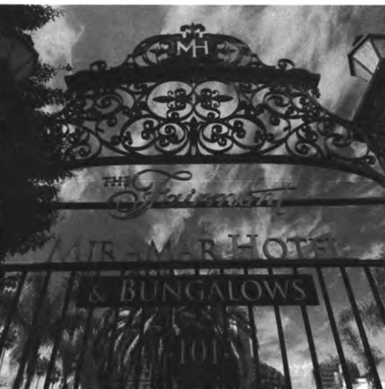
Miramar Hotel Gate

Graduate Programs in Historic Preservation, USC School of Architecture