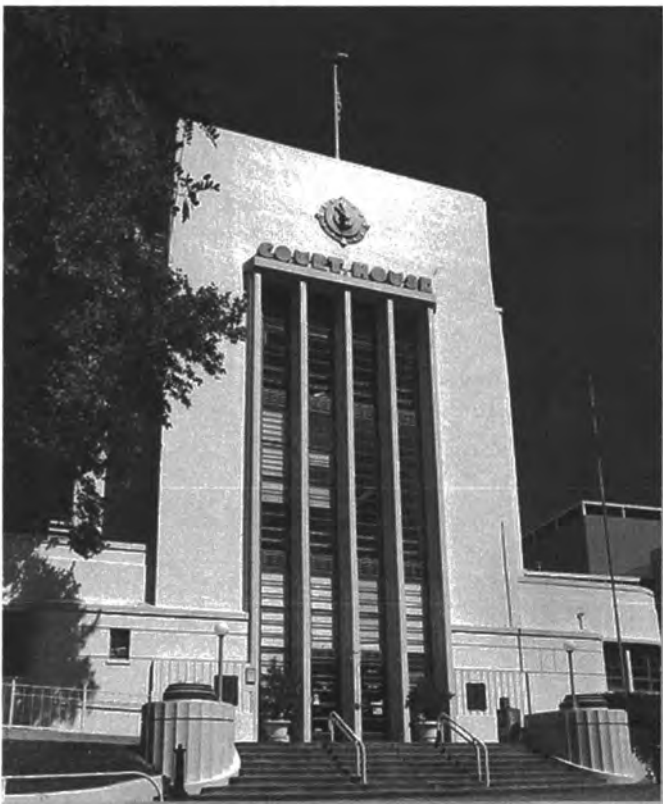
Nevada City County Courthouse.