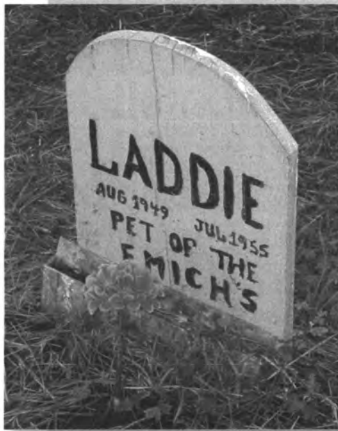
Grave Marker in the Pet Cemetery