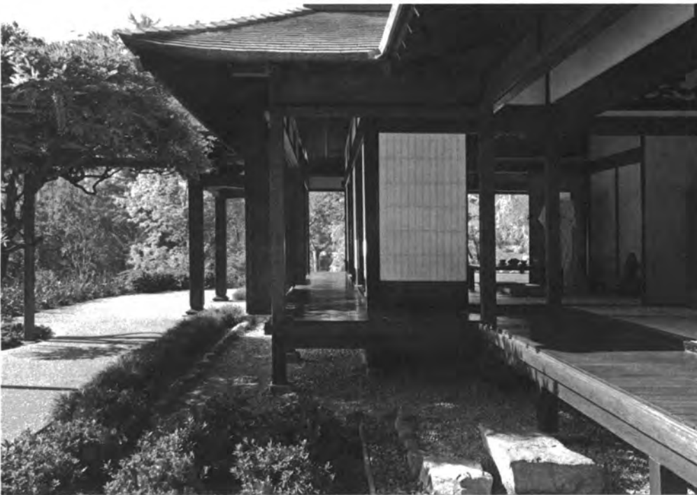
The Japanese House at The Huntington Library.

www.californiapreservation.org 415.495.0349