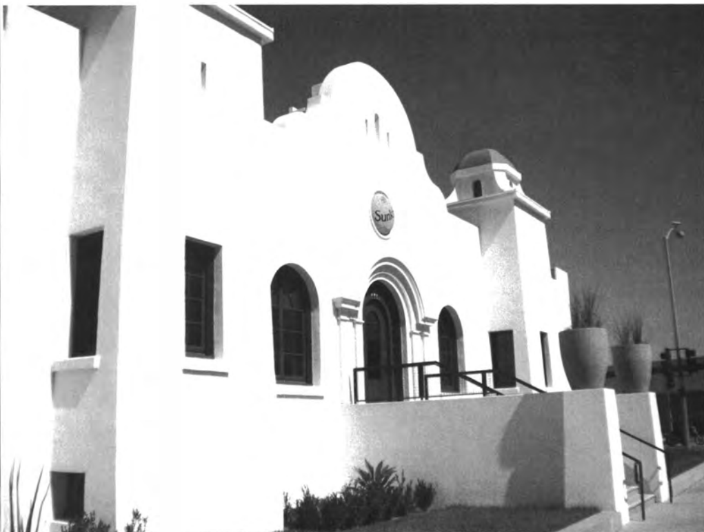
Rehabilitated Orange Packing Warehouse, Anaheim

Like Oakland, it has been 30 years since a conference has been held in Orange County. The Conference Planning and Programs committees are hard at work to bring you another informative conference. It will highlight Preservation's Wild Ride from the changes that have occurred affecting the preservation field to the future of preservation in California.