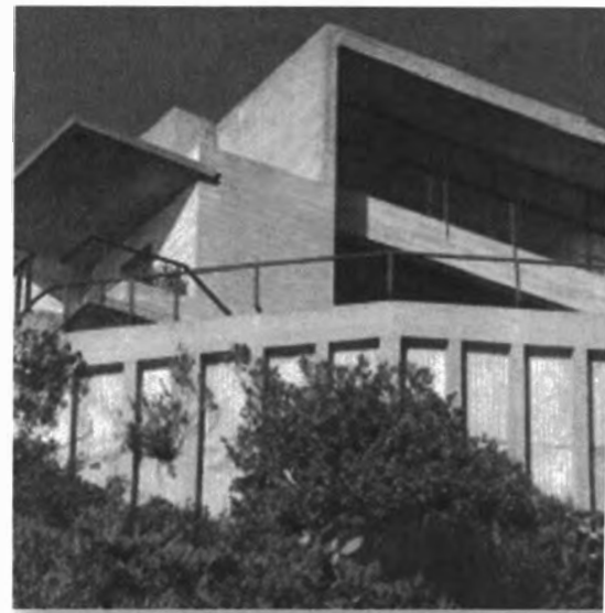
Haliburton House

Besides William Pereira, noted architects working in Irvine include Fisher-Friedman, Frank Gehry, Welton Becket Assoc., and landscape