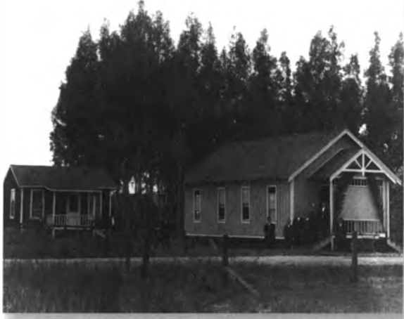
Wintersburg Japanese Presbyterian Mission, 1911; Photo: Courtesy Wintersburg Presbyterian Church