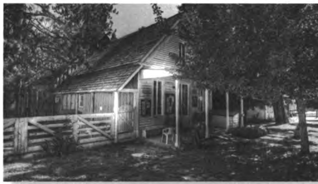
Malakoff Diggins State Historical Park, slated for closure.