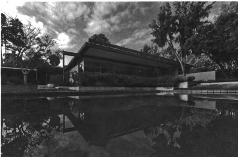
Kronish House by Richard Neutra.

In the City's most comprehensive surveys, conducted in 1986, 2004, and 2007, Beverly Hills identified more than 300 buildings that were potential historic resources. In July, the Commission designated the Beverly Hills Hotel, which celebrates its 100th birthday this year, as Historic Landmark No. 1.