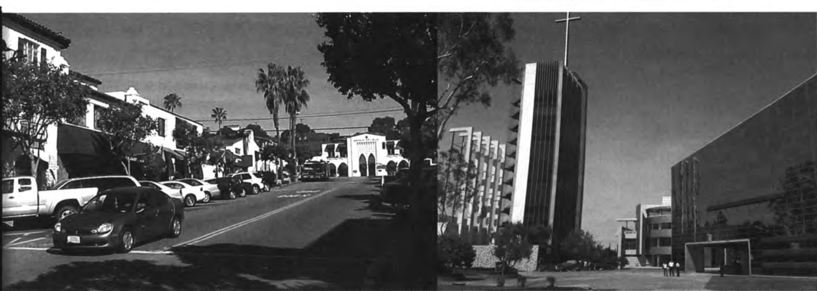
Downtown San Clemente (above) and Crystal Cathedral, Garden Grove (right)

Schindler's 1926 Lovell Beach House. John Lautner built four buildings here. Richard Neutra built houses, Mariners medical offices (currently threatened), Orange Coast College, the county courthouse, schools, and one of the most remarkable designs of his career: the 1961 drive-in Garden Grove Community Church for Rev. Robert Schuller.