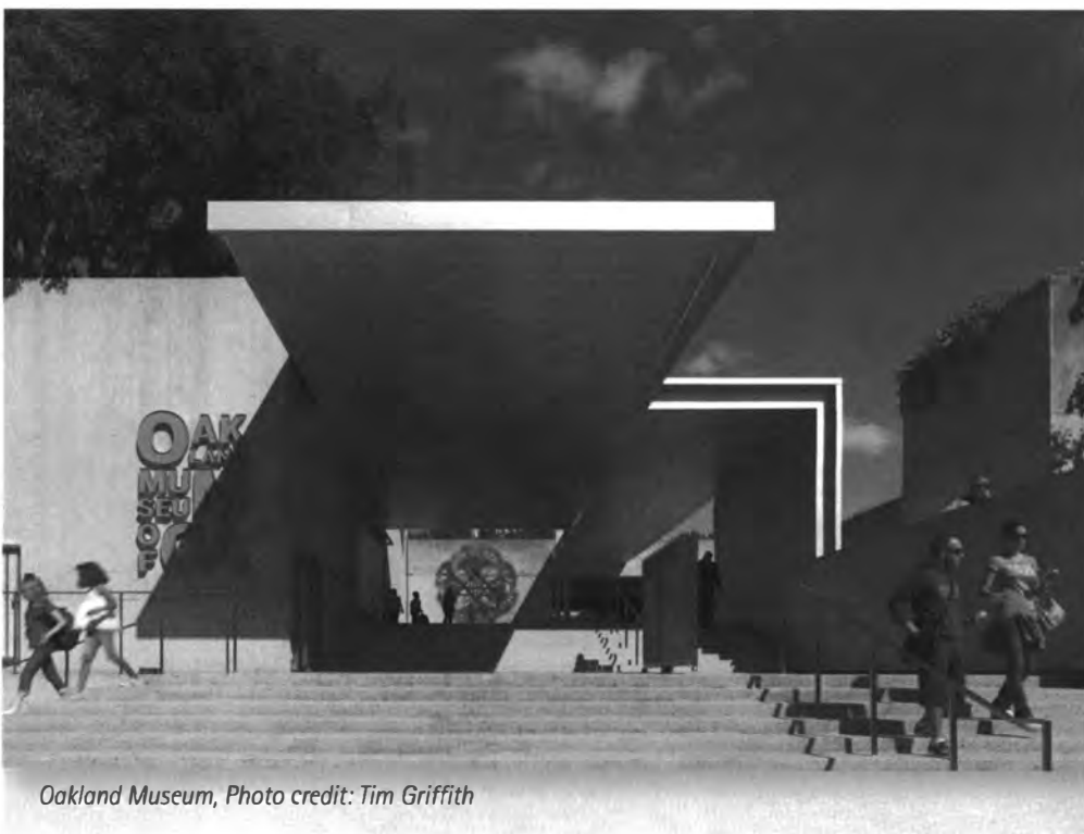
Oakland Museum