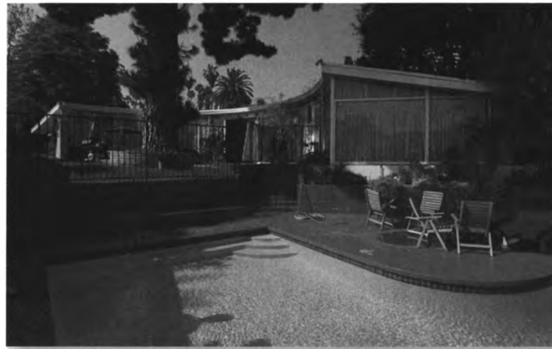
Shussett House by John Lautner.

mously approved the formation of a historic preservation ordinance and the formation of a Cultural Heritage Commission. The Beverly Hills Friars Club and the Shussett House by John Lautner were two victims of the city's lack of protection for historic properties: both were demolished within the past two years. Fortunately, Richard Neutra's Kronish House didn't meet the same fate. After word spread that the house was to be razed, the Los Angeles Conservancy, California Preservation Foundation and hundreds of preservation advocates lobbied the City of Beverly Hills to delay the issuance a demolition permit for the house so that a