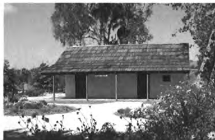
Montanez Adobe, San Juan Capistrano

The awards will be presented on Saturday, October 13, 2012, 6:00–8:30 pm at the AT&T Center, 1150 South Olive Street, Los Angeles. Tickets are $120 for individuals and $85 for CPF members and must be purchased in advance. To purchase tickets or see the award winning projects from the past 28 years, visit CPF's website.