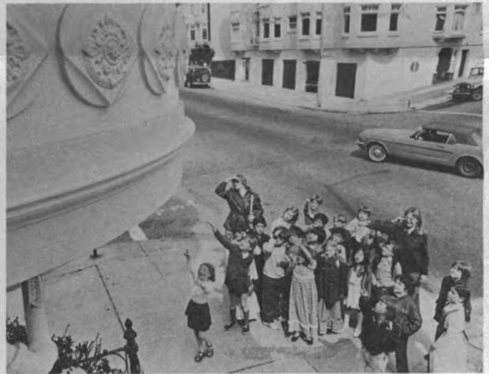
Students learn to identify architectural details.

Immediate results have been fruitful, and students have produced many drawings, photographs, reports, and research. But besides a lingering appreciation of Victorian homes, the volunteer program also encourages students to enter the restoration crafts. Thus they can help future San Franciscans preserve and maintain the city's irreplaceable legacy of 19th century architecture.