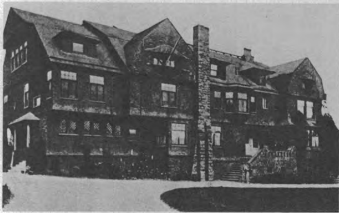
Berkeley's Channing Hall