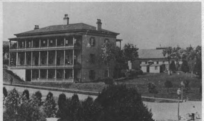
The Presidio Army Museum is housed in this building, originally the post hospital.