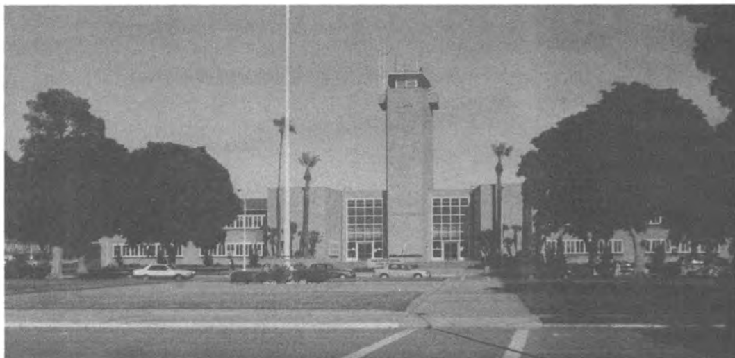
Long Beach Naval Station is the site of the Roosevelt Base Historic District, a campus of 11 buildings ca. 1940 which are primarily the work of Paul Williams, a prominent African-American architect. Under the current re-use plan, the district is slated for demolition, including the imposing International-style administration building pictured above.