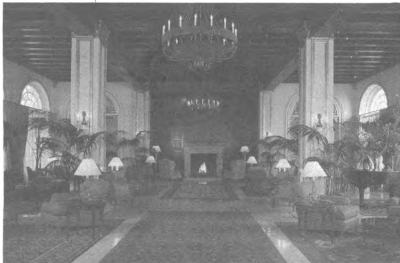
The luxurious, restored Palm Room Lounge at the Hotel Sainte Claire, CPF's 1996 Conference site and a National Historic Landmark.