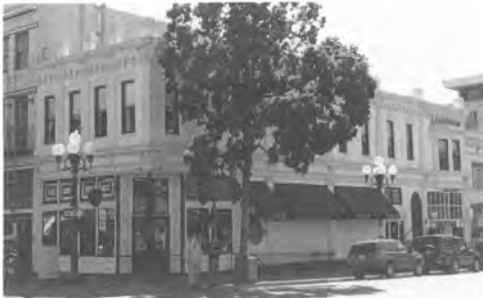
Spencer-Ogden Building San Diego, San Diego County Owner: Charles Blotting, The Bitter End, Inc. Costs: $1,500,000