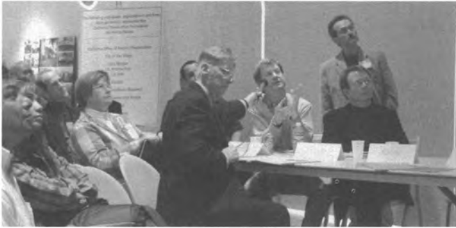
Speakers and participants at the February 27th workshop

Our thanks to the many sponsors, volunteers and speakers who contributed to the success of these workshops!