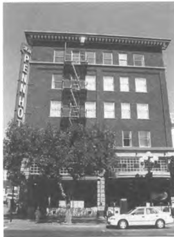
Oxford Hotel, aka William Penn Hotel San Diego, San Diego County Owner: William Penn Hotel, LLC Costs: $4,611,054