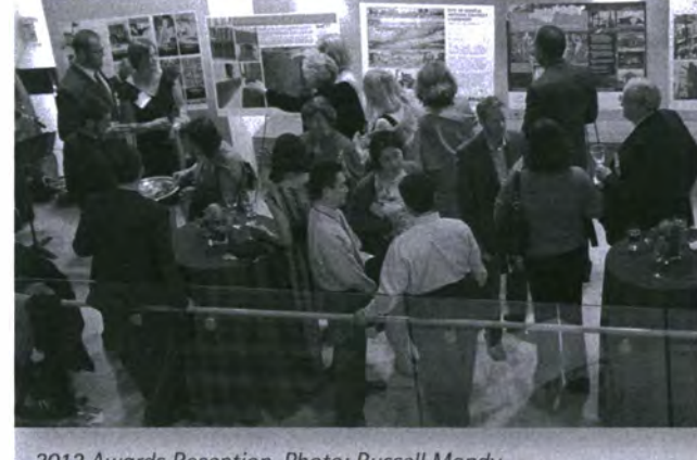
2012 Awards Reception.

On Saturday, October 1, 2011, the beautiful San Francisco Conservatory of Music was the site of the 28th annual Preservation Design Awards. The awards recognize people and projects throughout the state of California dedicated to preservation and restoration, while upholding important aspects and values of sustainability, use, and design in their work.