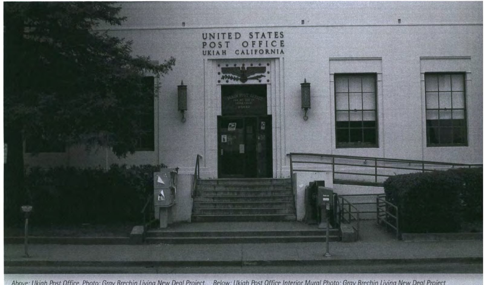
Above: Ukiah Post Office, Photo: Gray Brechin Living New Deal Project. Below: Ukiah Post Office Interior Mural Photo: Gray Brechin Living New Deal Project

several months, with full relocation complete in late 2012. The stated reason for this relocation is that the building is too large and has unneeded space. The building itself was designed by a prominent local architect, Birge Clark, whose buildings can be found throughout the city and still retains its historic interior.